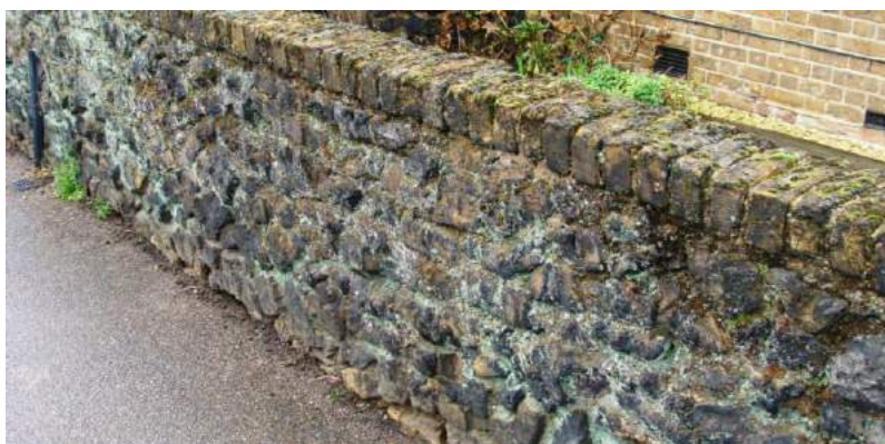
Picture 176. Unusual clinker wall construction to front of properties on Tamworth Road, worthy of retention and additional protection.

5.424. Wall to frontages of Nos. 84-100 Tamworth Road. Less than 1m and thus unprotected. Of unusual clinker construction. Also boundary walls of similar construction forming boundaries at right angles to road. An Article 4 Direction to provide protection for selected features may be appropriate subject to further consideration and notification.