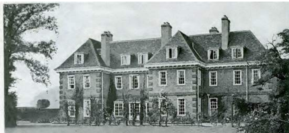
Picture 56. Bengoe House early 20th century.

The arch through to development at the rear was created in 1984. Now divided into flats, features are protected by normal development control legislation.