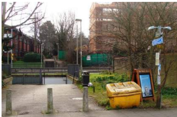
Picture 45. Small untidy area to south of Castle Street that would benefit from improvements.

5.81. Small untidy area to south side of Castle Street (opposite the Moat Garden, providing subway access). A small untidy area with signage advertisement signs and salt bin. Looks unattractive and uncared for. Proposals for its improvement are needed.