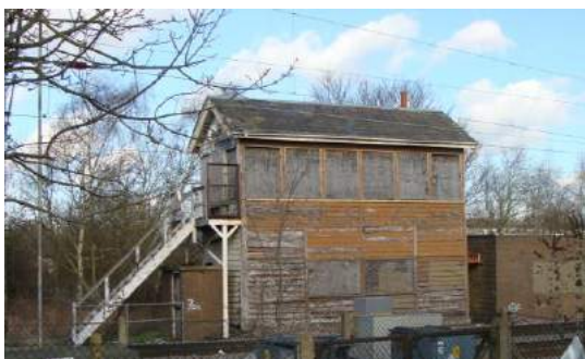
Picture 160. Signal box from late 19th century, lies just beyond the conservation area and is on the Council's Heritage at Risk Register. Could it be suitably moved to an alternative location in the town and provided with an appropriate alternative use?

5.375. Hertford East Station - Grade II. Railway station with terminal booking hall, concourse, 1888, with 20th century alterations. Built for the Great Eastern Railway. Architect W. N. Ashbee. Orange-red brick with stone windows, bands, dressings and cornices. Hertford East replaced the earlier Eastern Counties Railway Station further east along Railway Street, but this survived as a goods terminal until 1964.