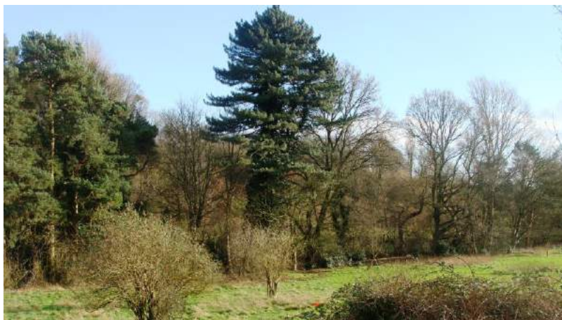
Picture 144. Open and treed land of considerable visual importance and which separates blocks of residential development from each other.

5.323. Important Open Spaces. Tract of grassland and treed areas between Queens Road and Mangrove Road and to the south of a well used metalled footpath connecting the above two roads. This land consists of grass fields and heavily treed areas which include visually important specimens including a number of Scots Pine. The land acts as a buffer between several principal blocks of development. It is distinct from the open countryside beyond both to the south and north. Its function and visual importance are reasons for it properly remaining within the conservation area. It is one of Hertford's 'Green Fingers'.