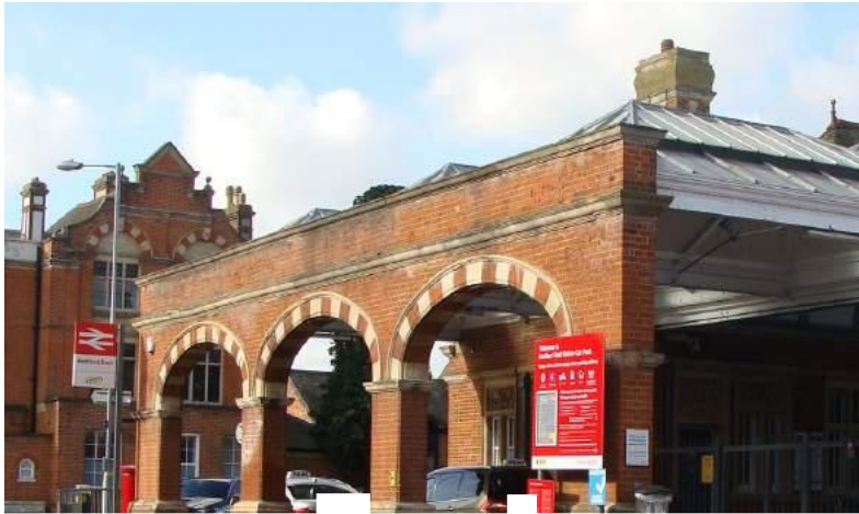
Picture 161. Hertford East railway station built in 1888, listed grade II.

5.376. The Saracen's Head Public House, Ware Road - Grade II. Mid 19th century, extended late 19th century. Yellow stock brick, Flemish bond, ground floor orange-red glazed brick, Flemish bond. Hipped Welsh slated roof. The 'Saracen's Head' was probably built as a house.