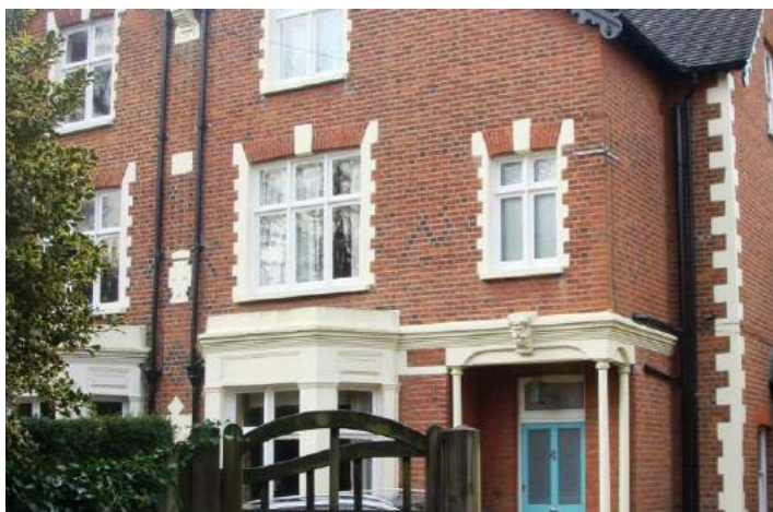
Picture 59. Good quality detailing that should be retained.

5.116. Property to the north and adjacent to No. 13 Bengoe Street. Large imposing detached property of yellow brick with recessed entrance, slate roof and chimneys. 2 No. bay windows to ground floor. Property under renovation associated with new development to rear at time of survey. Unless flat development, an Article 4 Direction to provide protection for selected features may be appropriate subject to further consideration and notification.