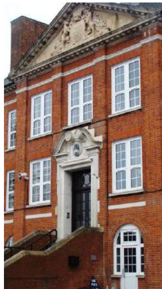
Picture 153. Imposing entrance to Richard Hale School, interpreted as being of mid 20th century date.

5.348. Original Richard Hale School. Interpretation of mapping indicates the original school building was erected about mid 20th century. A tall red brick prominent building with tiled roof. Elaborate main entrance detailing approached by steps with pediment containing ornately carved heraldic detail with cupola above.