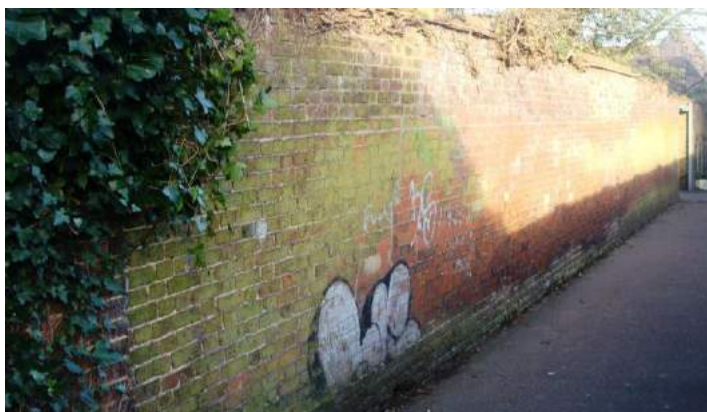
Picture 143. Wall forming boundary to Abel Smith playing field and adjacent to footpath need graffiti removing.

5.322. Tall wall to playing field of Abel Smith School adjacent to footpath. Graffiti needs removing.