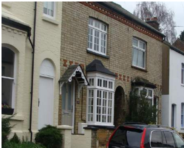
Picture 54. Another similar example, various replacement window types.