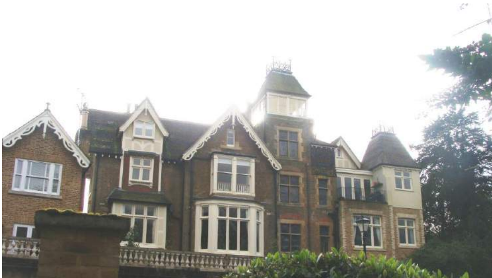
Picture 133. Springfield Lodge. Is the curious 'tower' for purposes of observation and overlooking the town? Is there any local knowledge?

5.300. Springfield Lodge, Mangrove Road/ Hagsdell Road. Dating from the 19th century this tall 3/4 storey yellow brick building with decorative tiled roof and chimneys dominates the local street scene. Many decorative features including barge boarding. Unusual feature with metal detailing protrudes above roof and overlooks the town which may have been an observation tower. Now divided into flats and thus protected by normal development control.