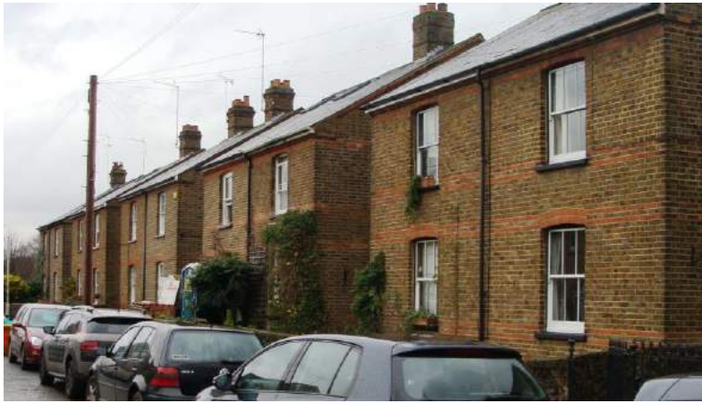
Picture 169. Nos. 80-102 Tamworth Road. Simple cottages of pleasing whose entrances are to the sides.

5.411. Nos. 111-159 Ware Road (excluding Nos. 127-129 necessary correction to be consistent with mapping): Large large 20th century properties of various types and designs. Tiled roofs and slate roofs with chimneys. Various brick, render and pebbledash. Some box shaped windows to both floors. Barge board, finial, decorative eaves detailing and date plaque 1907 noted. Some three storey with decorative detailing, balconies. Nos.111-115 have fine boundary walls. Some properties are flats. An Article 4 Direction to provide protection for selected features on conventional residential properties may be appropriate subject to further consideration and notification.