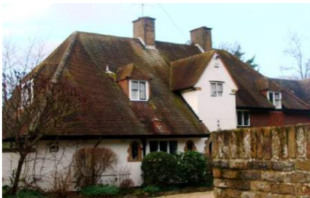
Picture 131. A single storey building with imposing roof probably dating from the mid 20th century constructed of good materials and playing its role in painting a picture of the towns more recent history.

5.291. No. 2 Morgans Road. Probably dates from the mid 20th century. Single storey with huge steeply pitched roof chimneys. Imposing building and representative of its type and period. An Article 4 Direction to provide protection for selected features may be appropriate subject to further consideration and notification.