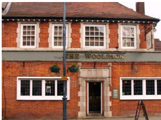
Picture 321. The Woolpack PH nicely proportioned and detailed commercial building.

5.42. The Woolpack PH, Mill Bridge. Two storey red brick building with tiled roof and chimneys. Some good quality windows with stone surround detailing. Normal development control administers alterations.