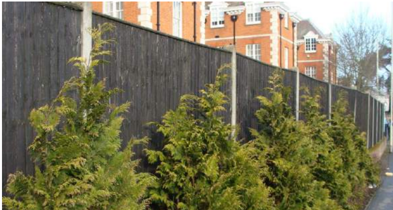
Picture 47. Inappropriate wooden fencing adjacent to concentration of listed buildings on Mill Road.

5.84. Wooden fence to east boundary of Bluecoats on Mill Road. Bearing in mind the high quality and concentration of nearby listed buildings and structures, this fencing is visually inappropriate.