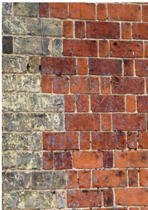
Picture 55. Rat trap brick bonding to Nos. 22-40 Bengo Street that is most unusual and which should not be rendered or painted over. This bonding of bricks laid on edge provided a stable and cheaper form of construction sometimes used in the 19th century.

5.108. Nos. 8-18 Bengo Street. A 19th century terrace of yellow brick construction with slate roofs and chimneys with pots. Modern windows and porch detract from historic detailing. Nevertheless the overall mass contributes positively to the Conservation area. Central plaque WATERLOO TERRACE PORT HILL 1851 adds to historical relevance. An Article 4 Direction to provide protection for selected features may be appropriate subject to further consideration and notification.