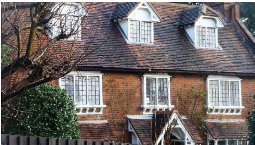
Picture 52. The Old Pest House, a former isolation hospital built by Thomas Dimsdale. A grade II listed building of pleasing design.

5.96. The Old Pest House corner of Fanshawe/ Byde Street. Grade II. Built as Isolation Hospital. Mid 18th century, altered and embellished late 19th century. Red brick, Flemish bond, old tiled roof with brick parapeted ends, and half Dutch gables at rear. Elaborate brick chimneystacks left and right with moulded bands and oversailing caps. Central raised tile hung flat-roofed rear extension above lower slope of low swept-slip roof. The Old Pest House was built in 1763 as an isolation hospital against smallpox by Thomas Dimsdale (1712-1800) who lived at Port Hill House.