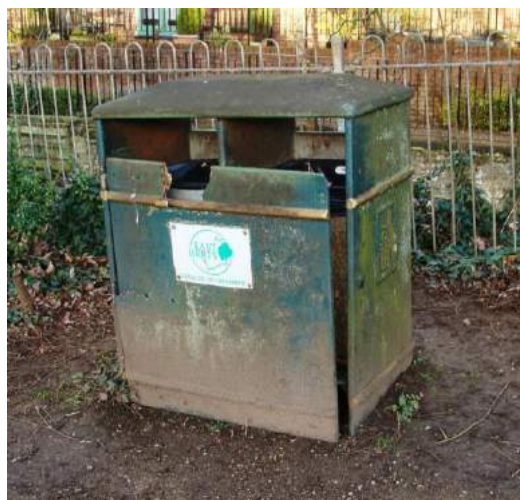
Pictures 41-42. Various detracting aspects of Millennium Sculpture area. Badly worn surfaces and shattered litter bin. This area is in real need of improvement, a view independently shared with the Hertford Urban Design Strategy.

5.71. Locally Important Historic Parks and Gardens. There are three locally important gardens so identified in the 2007 Supplementary Planning document 'Historic parks & Gardens' in Area 1.