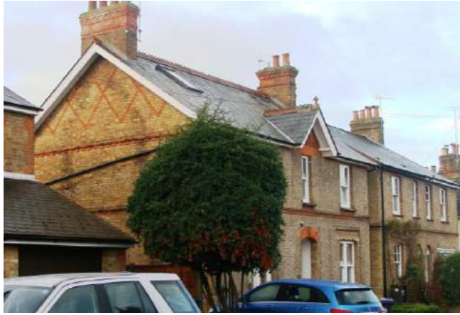
Picture 54. Late 19th/early 20th century housing at Trinity Grove which retains much of its original character.

5.106. Nos. 13-19 Trinity Grove. Late 19th century grouping of brick and render slate roof chimneys with pots, some early sympathetic vertical sliding sash windows. An Article 4 Direction to provide protection for selected features may be appropriate subject to further consideration and notification.