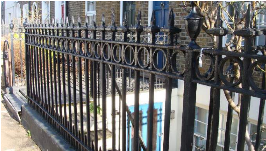
Picture 173. High quality railings to front of Nos. 14 -16 Villiers Street. Note basement accommodation below ground level.

5.417. Historic and later railings to frontages of Nos. 4-16 Villiers Street and frontage and return to No.36. The former define and enclose accommodations below ground whilst the latter are more recent but interpreted as being erected on earlier dwarf wall capped with engineering bricks.