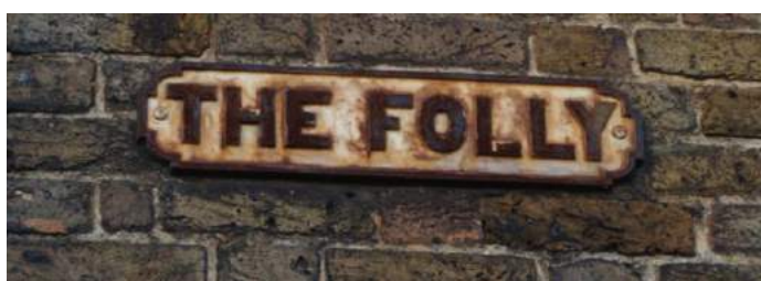
Picture 118. Throughout the conservation area, principally on 19th century terrace developments early/original street names can be found. They are part of the rich tapestry of the town that should be retained.

5.260. Wall forming west boundary of Hertford Town Church site. Red brick boundary wall. If height less than 2m an Article 4 Direction may be appropriate.