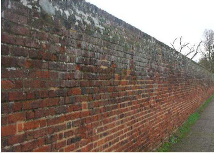
Picture 111. Prominent brick wall fronting a Listed building that is an important element in the street scene.