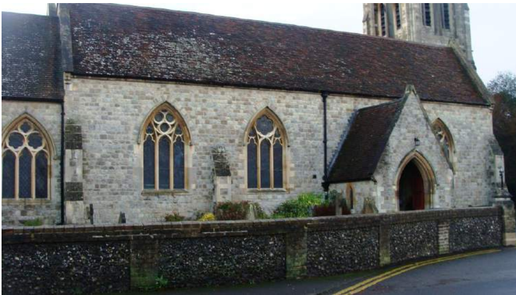
Picture 51. Church of the Holy Trinity, New Street Road. A typical Victorian church from the mid 19th century set in extensive grounds with prominent boundary wall.

5.96. The Old Pest House corner of Fanshawe/ Byde Street. Grade II. Built as Isolation Hospital. Mid 18th century, altered and embellished late 19th century. Red brick, Flemish bond, old tiled roof with brick parapeted ends, and half Dutch gables at rear. Elaborate brick chimneystacks left and right with moulded bands and oversailing caps. Central raised tile hung flat-roofed rear extension above lower slope of low swept-slip roof. The Old Pest House was built in 1763 as an isolation hospital against smallpox by Thomas Dimsdale (1712-1800) who lived at Port Hill House.