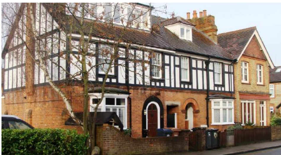
Picture 61. Nos. 69-73 Bengo Street Road. An example in the fieldworker's opinion where the positive contribution of the overall mass of this group outweigh some of the less satisfactory later alterations.

5.119. Nos. 69-73 Bengo Street. Large prominent block in street scene dating from early/mid 20th century. No. 73 was formerly a shop with window appropriate to that use remaining. Tiled roof and chimneys with pots. Brick with significant area of render and decorative wooden detailing to part first floor. Recessed entrances, one unfortunately enclosed. Dormers to roof detract. On balance the contribution the mass of the block makes to the conservation area is considered to outweigh the impact of the later and less satisfactory alterations. An Article 4 Direction to provide protection for selected features may be appropriate subject to further consideration and notification.