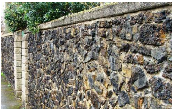
Picture 179. Unusual clinker wall of historic interest that adds variety to the local street scene and worthy of retention. Wall of similar construction on Tamworth Road.

5.427. Wall to No. 135 Ware Road, returning into Fairfax Road. Height varies mostly over 1m but some being unprotected under 1m. Of clinker construction with coarse concrete/ aggregate capping detail.