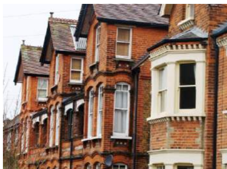
Picture 171. Good quality three storey early 20th century housing, Ware Road, within the eastern end of the extended conservation area.

5.412. Nos.30- 46A Tamworth Road. Principally dDate from the early 20th century principally with slate roofs. During consultation advice was received that Nos. 30-32 were built in 1947 following the area being bombed in WW II. This being the case the pair has been rebuilt in similar style to those adjacent, although perhaps not quite as elegantly. Recessed entrances, names of properties inscribed /painted; bay windows to both floors, mixed window types. An Article 4 Direction to provide protection for selected features may be appropriate subject to further consideration and notification.