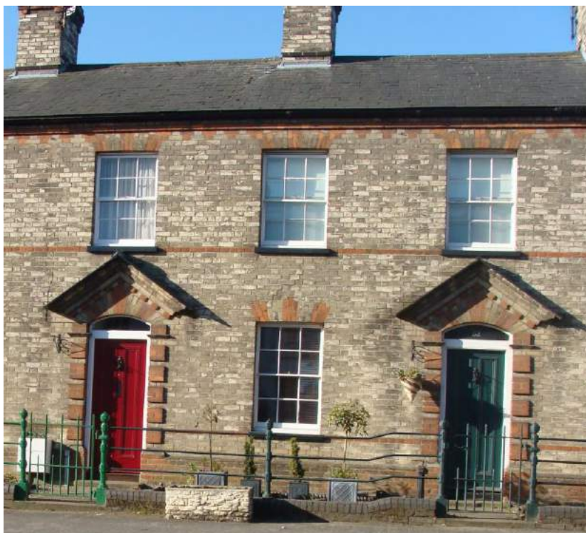
Picture 187. A listed terrace not local to East Hertfordshire. The purpose of this picture is to illustrate the importance of design detail in relation to traditional late19th/early20th century terraces. There are large numbers of similar unlisted terraces in Hertford identified by this appraisal as being important. Retaining the character of such terraces in part depends on keeping simple original repetitive detailing, including doors. Compare this simple solution with some of the previous illustrations which do not provide any sense of architectural 'rhythm' and are disruptive. Expression of ownership can be provided by painting doors different colours.

5.5. In some locations in Hertford larger scale redevelopment is taking place. Sometimes within these areas there are historic terraces or corner buildings still remaining. Often it will be important for such features to remain.