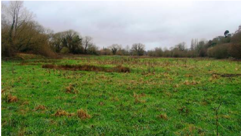
Picture 121. Hartham Common, an accessible recreational area of great environmental and communal interest to the town. Its retention is most important.

area in the southern part of the site. It is of significant importance to the well being of the town for the wide variety of reasons briefly referred to above.