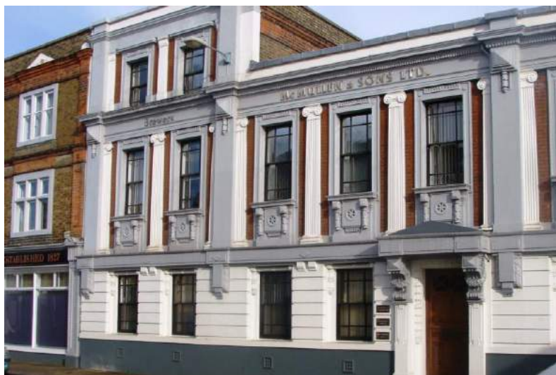
Picture 108. Part of the McMullen complex. Although not individually listed this building is one of the finest such buildings in Hertford and one most worthy of retention.

5.244. Folly Island. Principally of late 19th century date (some modern replacements). Consists of The Folly, Thornton Street, Old Hall Street and Frampton Street. Most streets are tree lined and some terraces front onto the river. Two storey and of yellow brick construction with slate roofs and prominent chimneys. A mixture of traditional and historically inappropriate window detailing together with some porches and roof lights noted. Overall a most delightful area and one worthy of careful protection. Parking on streets detracts. In this respect would there be support for making some addition such provision on the adjoining allotment land? An Article 4 Direction to provide protection for selected features may be appropriate subject to further consideration and notification.