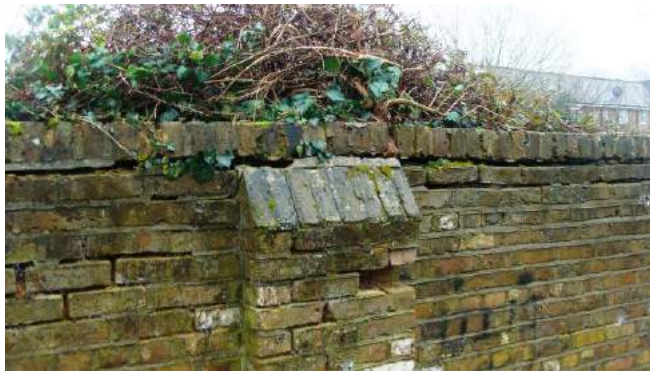
Picture 96. Wall at Pilleway Pitteway Walk in need of repair.

5.211. Opportunities to secure improvements. Remove ivy from Holy Trinity boundary wall whilst task remains minor. Consider future of Bengo Car Centre site. Consider future of former railway line south east of Nelson Street which is overgrown and untidy. Following site survey representation, remove ivy as necessary from selected trees on open space land to the south west of Mill-mead Way. Repair yellow brick wall of late 19th/early 20th century date, adjacent to Pilleway Pitteway Walk (assumed to be in ownership of Millmead School). Seek to achieve comprehensive visual improvements to selected parts of Millmead school site. Remove graffiti on railway bridge supports, south end of Bengo Street.