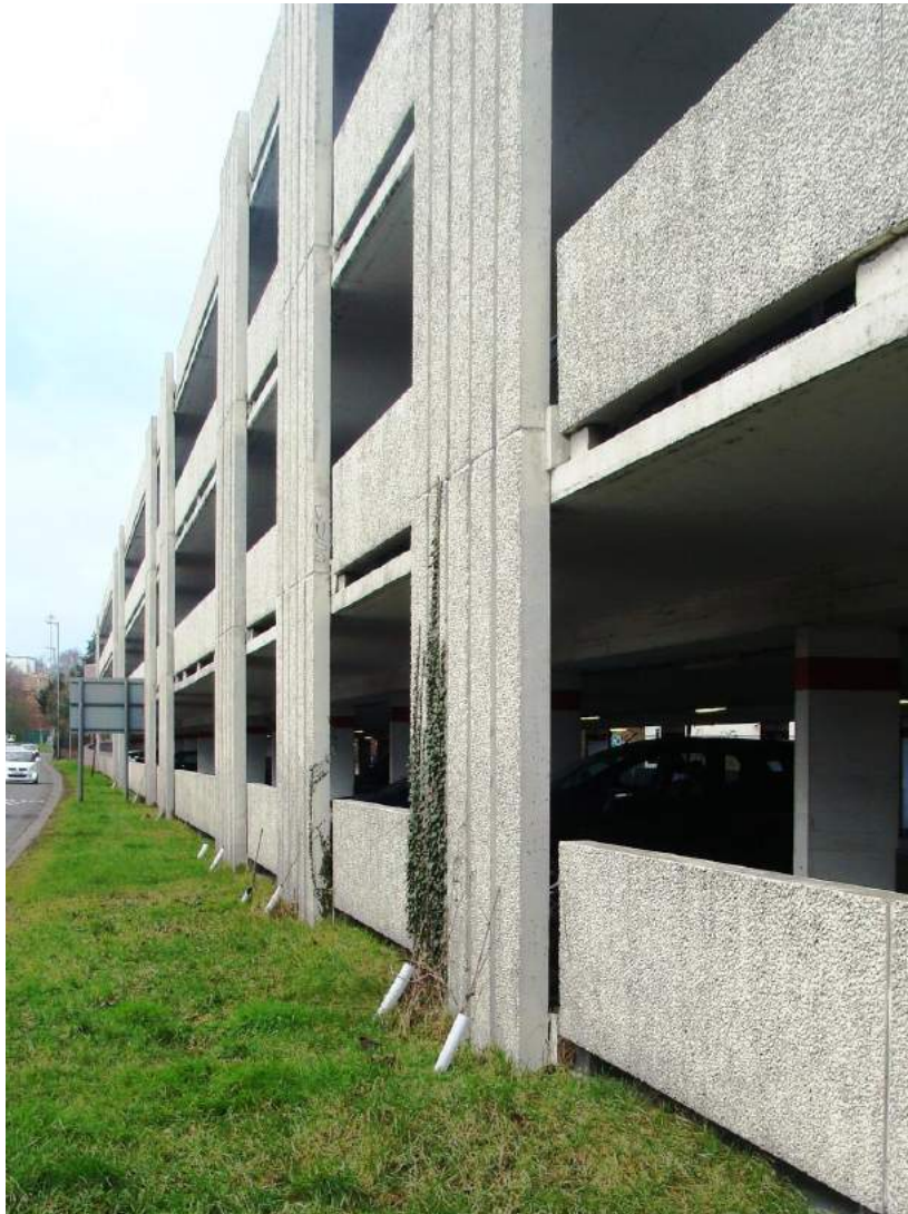
Picture 49. Attaining external professional advice to reduce the visual impact of Gascoyne Way car park is recommended.

5.87. Opportunities to secure improvements. Improvements to various shop front facias in the main central commercial areas. Consider implementing minor repair works to frontage wall of random brick and clinker construction to front of hospital site. Significant improvements will materialise through the planning process for the former Emmaus superstore site and the Noble car parking site. Prepare landscape enhancement plan to improve the Moat Garden on Castle Street. Secure improvements to subway access approach south side of Castle Street. Improve environmental quality of area adjacent to William H Brown building. Improve open space adjacent to theatre containing the Hertford Millennium sculpture. Refurbishment of No. 8 The Wash, a listed