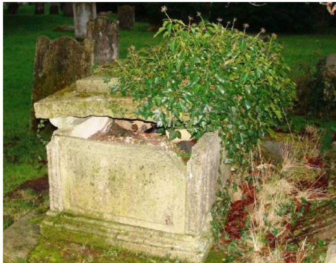
Pictures 146-147. Upper picture shows tombs, All Saints churchyard, completely covered by ivy (condition and type unknown); lower picture shows chest tomb in need of repair and in earlier stages of being enveloped with ivy.

5.326. Green finger of trees at north east side of Mangrove Road. This treed area is visually most important and in part is an environmental island within a heavily trafficked area and a very well used pedestrian route, particularly for school children.