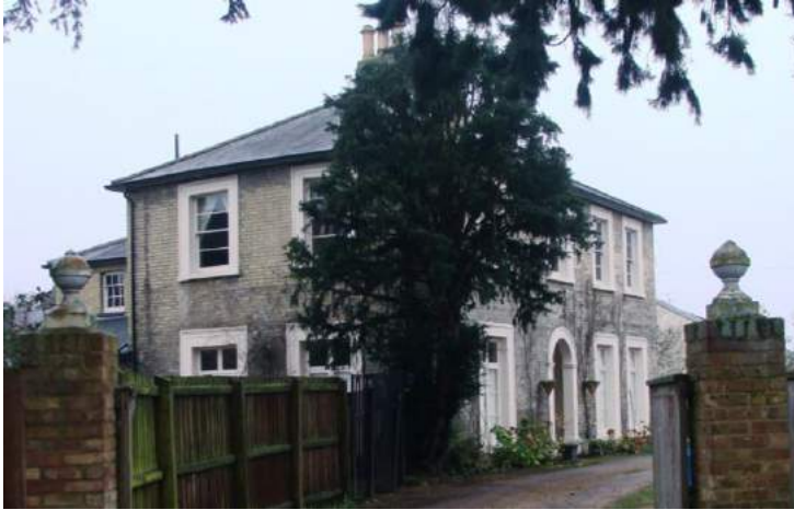
Picture 62. The Yews - a tall prominent property on Bengo Street.

provide protection for selected features may be appropriate subject to further consideration and notification. Fine tree of Wellingtonia species to front.