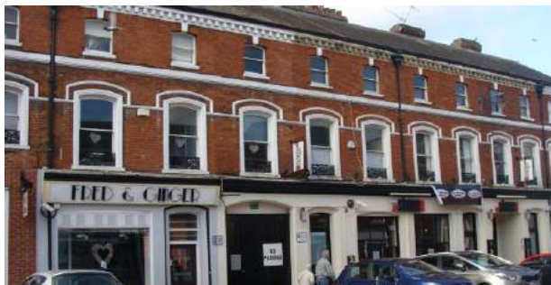
Picture 365. Prominent and largely unspoilt group of commercial properties Bull Plain.

height with distinctive window detailing and surrounds and cast iron detailing to second floor. Slate roof. Largely unspoilt. Normal development control administers alterations.