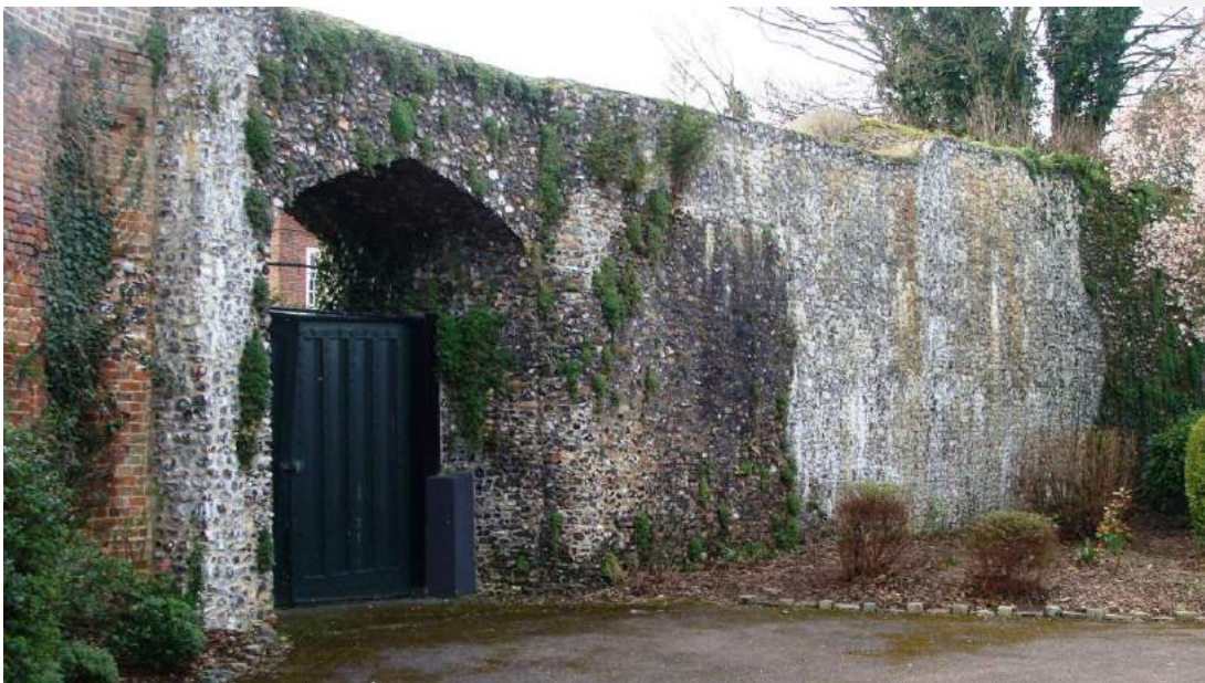
Picture 243. Impressive walls dating from the late 12th century with later additions/alterations, listed Grade II*.

5.21. Hertford Castle Bailey Walls - Grade II*. Curtain wall along north-east side of Castle Bailey. Late 12th century with later repairs and alterations. Flint rubble with clunch blocks, and extensive repairs and rebuilding in red brick laid to English bond. At south-east corner is a screen totally rebuilt in red brick. The wall attains its greatest height of 15 -18 ft, without later crenellations. Also south-east range along south-east side of Castle Bailey of similar date.