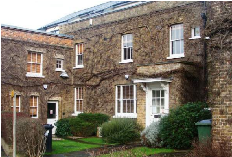
Picture 110. Handsome building corner Railway/Priory Street; most worthy of retention.

5.249. Nos. 4-10 Priory Street. Two storey late 19th century terrace of yellow brick construction with slate roofs, chimney. Good quality vertical sliding sash windows. Situated in an area of ongoing redevelopment and as thus most worthy of retention. An Article 4 Direction to provide protection for selected features may be appropriate subject to further consideration and notification.