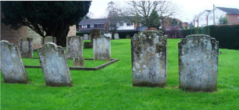
Picture 120. Important and well kept churchyard with many interesting tombstones.

5.262. St. Leonard's churchyard. A well kept churchyard with some mature trees and many tombstones, some chest and one such chest tomb in urgent need of repair. Iron railings to front (see above).