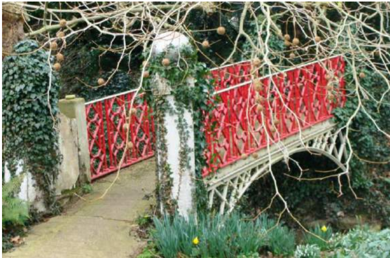
Picture 240. Charming 19th century listed footbridge over mill stream.

5.18. Church of St Andrew, St Andrew Street - Grade II. Anglican church 1869-70, incorporating 15th century doorway from earlier church on site, steeple completed 1875-6. Flint with grey limestone dressings and bands, fine yellow sandstone windows. Welsh slated roofs with red ridge tiles. High Victorian Gothic Revival, Early English and Decorated. Cruciform plan, 4 bay nave, half-octagonal chancel corner. West steeple, nave with aisles, transepts, chancel, north porch. Several memorials reset from earlier church, including 15 black or cream incised slabs dispersed through nave and transepts. South transept has large wall tablet, white marble on black marble background slab, commemorating Nathaniel Dimsdale, Baron of the Empire of all the Russias, who together with his father, had inoculated Catherine the Great against smallpox. The church appears on Historic England's Heritage at Risk Register and officers are in discussion with the parties. The issues are structural and roof deterioration. A Heritage Lottery grant has been applied for.