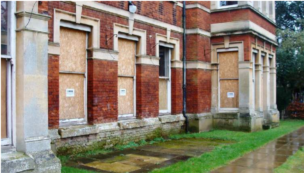
Picture 152. Leahoe House within the County Hall complex. A fine 19th century building in declining condition whose retention is important and whose future needs ascertaining.

5.348. Original Richard Hale School. Interpretation of mapping indicates the original school building was erected about mid 20th century. A tall red brick prominent building with tiled roof. Elaborate main entrance detailing approached by steps with pediment containing ornately carved heraldic detail with cupola above.