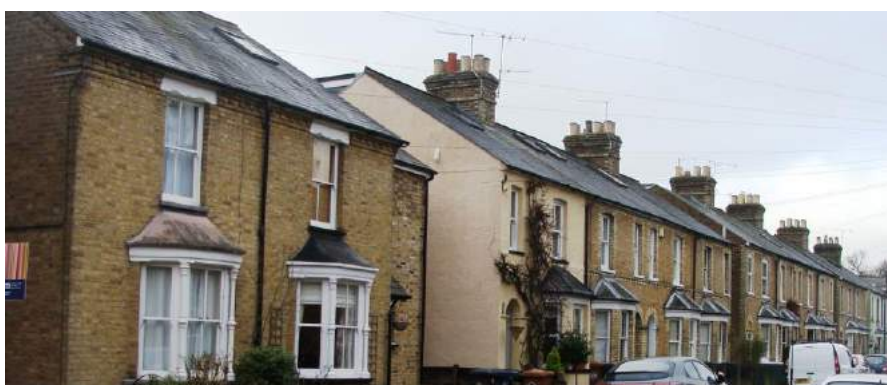
Picture 68. View along Parkhurst Road, a pleasant historic street with strong architectural rhythm provided by roofscape and repetitive bay windows.

5.138. Yew Villa and Nos.4-36 and 1-37 Parkhurst Road. A late 19th/early 20th century street characterised principally by long terraces of two storey yellow brick cottages with slate roofs and prominent chimneys with pots. A number of bay windows provide strong features in some locations. Some inappropriate detailing but much of street remains intact. Early street sign attached to No.36. An Article 4 Direction to provide protection for selected features may be appropriate subject to further consideration and notification.