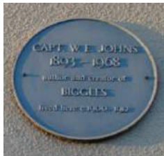
Picture 78. Plaque advising that Captain Johns, creator of Biggles lived here.

5.179. Nos. 27-41 Cowbridge. A group of properties principally in commercial use to ground floor in a strategic location. One property advertises the fact that a Captain Johns who was author and creator of Biggles lived here. The commercial properties would benefit from refurbishment and regeneration. There is some good quality window detailing and on balance it is considered the group warrants retention.