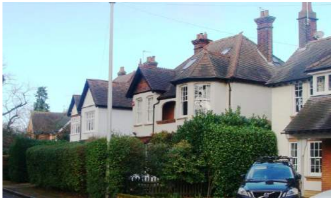
Picture 132. Good quality 20th century housing at Highfield Road, north side, displaying many interesting features typical of the period.

5.294. Highfield Road. North side- Highfield Court, Nos. 4-18 (omit 18A) and No. 20. South side - Nos. 1, 3A and 5. A variety of housing types, mostly large two storey detached; some date from earlier 20th century, others later 20th century. Of render/red brick construction with tiled roofs and chimneys. Many quality details include turrets, decorative tile detailing, finials barge boarding, balconies, recessed entrances, bay windows some good window detailing. An Article 4 Direction to provide protection for selected features may be appropriate subject to further consideration and notification.