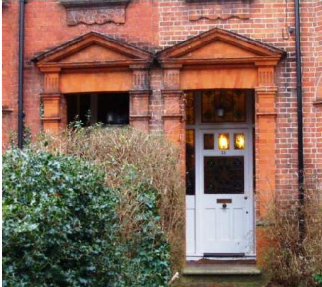
Picture 134. Recessed entrance detailing to properties east side of Queen's Road.

of roof materials and chimneys. Good quality detailing throughout includes prominent bay windows, date plaques, recessed entrances and some original glass detail. Various of yellow brick with red brick banding; red brick, some render with decorative wooded detailing. Window detailing is generally sympathetic. An Article 4 Direction to provide protection for selected features may be appropriate subject to further consideration and notification.