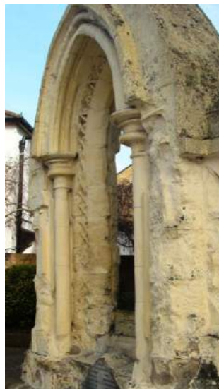
Picture 276. Fragments of St Mary the Less discovered and subsequently erected in 1890.

5. 25. Fragments of the church of St Mary the Less, Old Cross. Drinking fountain. 1890, reconstructed from fragments of the former Hertford Church of St Mary the Less which were found on the site during the construction of the Library in 1880. The church was built before 1210 and destroyed before 1552. The structure is clunch stone, consisting of a base, with a small pointed arch with crude roll mouldings above a drainage recess. A tablet set in the base of the lancet opening records the history of the structure which was erected by public subscription.