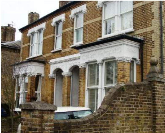
Picture 167. Decorative detailing to Nos. 51-53 Ware Road. Note boundary wall worthy of retention.

detailing. Mix of window types. An Article 4 Direction to provide protection for selected features may be appropriate subject to further consideration and notification.