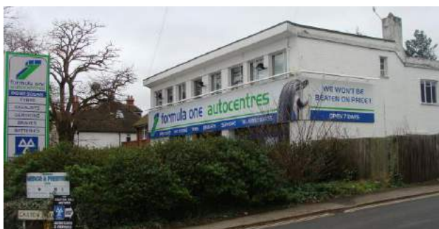
Picture 181. The potential of appropriate redevelopment of this site might be worthy of consideration to improve this part of the conservation area.

5.434. Formula 1 Autocentres, Ware Road. This large flat roof building does little to improve the street scene where the potential of appropriate redevelopment might be an option to consider as a catalyst for achieving improvements.