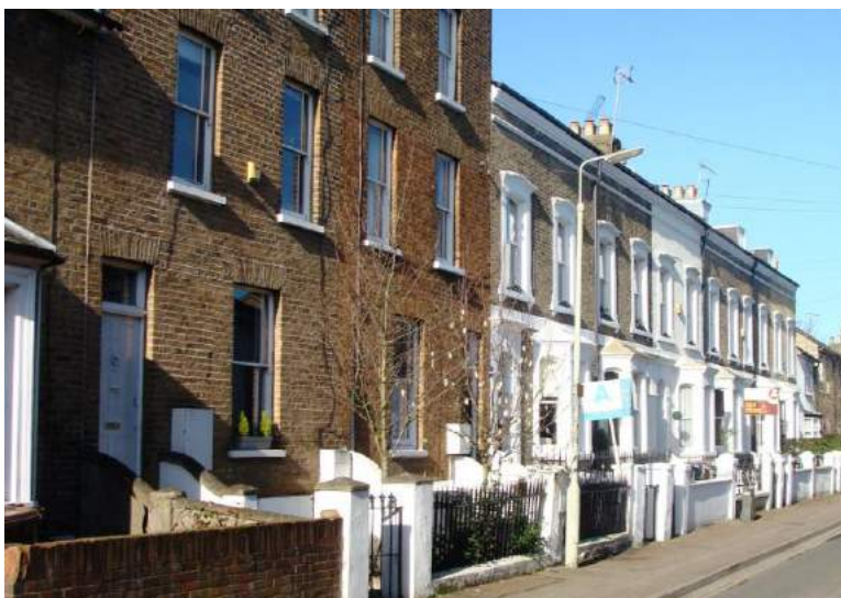
Picture 164. West side of Villiers Street, an attractive grouping with a wide range of good quality detailing most worthy of retention and preservation.

5.384. Nos. 3-37 Villiers Street west side. Very attractive 19th century group with variety of types of yellow brick construction with slate roofs and chimneys with pots. Heights vary including one prominent three storey building. Bay windows. Good canopy, window surrounds and recessed entrance details noted. An Article 4 Direction to provide protection for selected features may be appropriate subject to further consideration and notification.