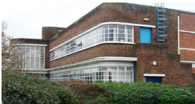
Picture 163. Former Addis factory, an increasingly rare example of modern architecture from the 1930's.

5.378. Scheduled Ancient Monuments There are none in Area 6.