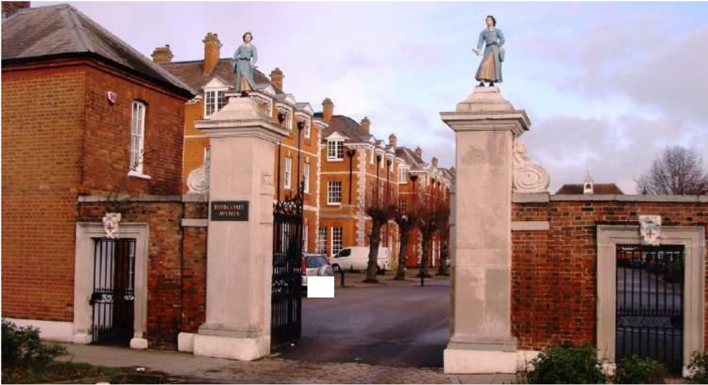
Picture 265. A fine grouping of listed buildings, walls and other structures at Bluecoats.

5. 25. Fragments of the church of St Mary the Less, Old Cross. Drinking fountain. 1890, reconstructed from fragments of the former Hertford Church of St Mary the Less which were found on the site during the construction of the Library in 1880. The church was built before 1210 and destroyed before 1552. The structure is clunch stone, consisting of a base, with a small pointed arch with crude roll mouldings above a drainage recess. A tablet set in the base of the lancet opening records the history of the structure which was erected by public subscription.