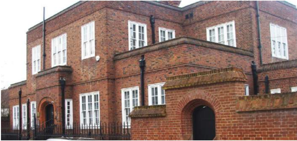
Picture 340. Interesting flat roof building of early 20th century date, unusual and most worthy of retention. Does any reader have more information concerning its original use? A public building?

railings on dwarf wall to front. Early vertical sliding sash windows. In commercial use; alterations administered by normal development control.