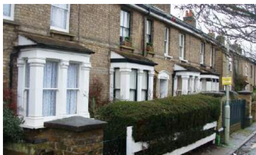
Picture 74. Distinctive window detailing to Nos. 37-43 Port Vale most worthy of retention.

5.164. No. 35 Port Vale. Tall two storey corner building dating from early 20th century. Of red brick construction with slate roof and chimneys. Recessed entrance and stone detailing. Ornate decorative entwined plaque reads AD 1904. An Article 4 Direction to provide protection for selected features may be appropriate subject to further consideration and notification.