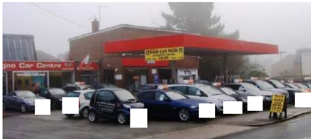
Picture 93. The Bengeo Car Centre site detracts from this part of the Conservation Area. Opportunities for improvements are worthy of pursuing with the owner.

5.208. Elements out of character with the Conservation Area. Bengeo Car Centre and store. This is a prominent site in the street scene and linear part of the Conservation Area. No doubt it performs an important commercial and community function but its appearance does detract. Practically any meaningful improvements could only be secured by redevelopment. Historically the site would appear to have been developed in the late 19th century, assumed as houses. Opportunities to achieve improvements to the existing site are limited but could include reducing the impact of the prominent red paintwork by a more restrained colour choice.