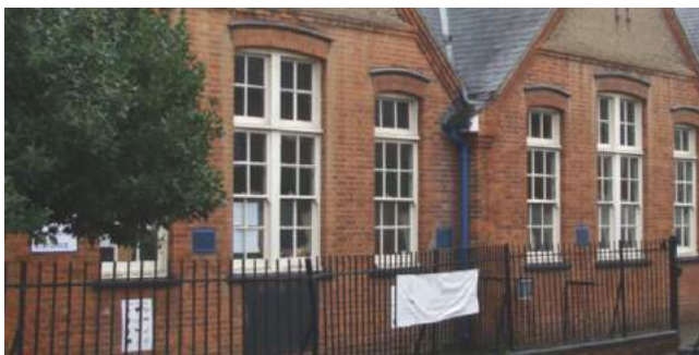
Picture 75. Early 20th century historic element of Mill Mead School.

5.165. Mill Mead School (early element at eastern end of site). Dating from the early 20th century constructed of red brick with slate roof and prominent chimneys. Tall original windows worthy of retention in original form and possibly subject to an Article 4 Direction subject to notification and further consideration. The remainder of the school site is not visually pleasing (see below).