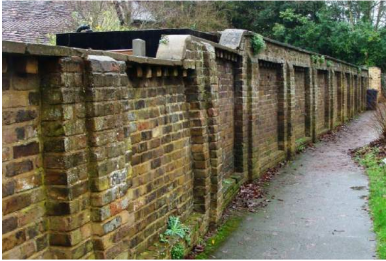
Picture 115. Prominent brick wall important to the quality of Warren Park Road.