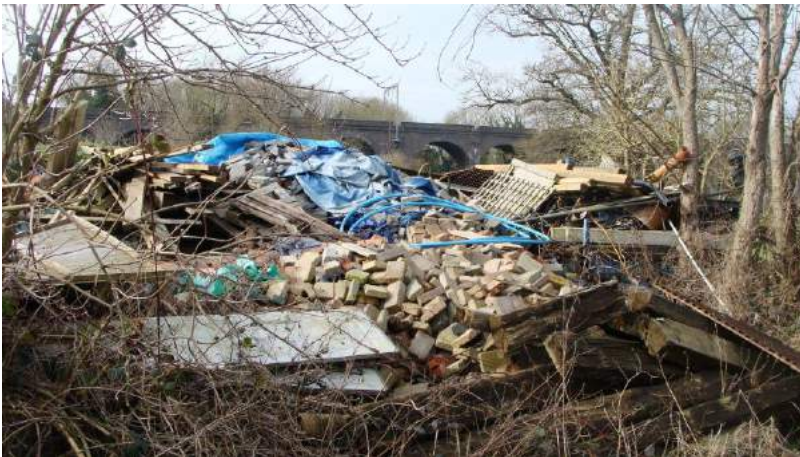
Pictures 156-158. Areas adjacent to Cole Green Way in and around Hertford FC where modest action could achieve significant improvements.