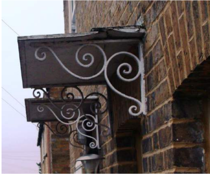
Picture 104. Early canopies on metal bracket supports which add to the interest of the street scene and which are worthy of retention.

5.232. Nos. 10-16 Warren Terrace. Two storey later 19th terrace of brick construction with slate roofs and chimneys with pots. (Some later render application and replacement tiles to No.10. Some modern window detailing.