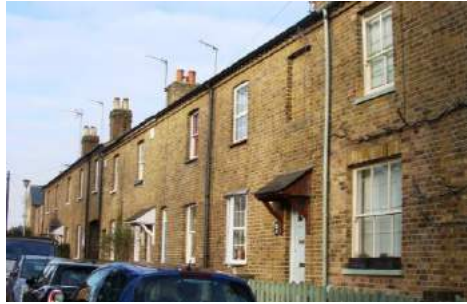
Picture 73. Balfour Street a typical 19th century street with some early porch detailing still remaining. Wouldn't it be nice to carefully replicate this detail above other entrances?

5.160. Nos. 6-34 Balfour Street. Continuous two storey yellow brick 19th century terrace with slate roofs, prominent chimneys with pots. Some early porch detailing. Some early/sympathetic windows, other altered. Despite this the overall mass of the group outweighs individual unsympathetic alterations. An Article 4 Direction to provide protection for selected features may be appropriate subject to further consideration and notification.