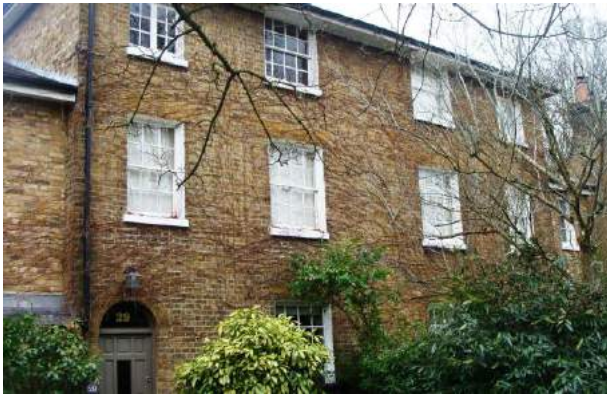
Picture 77. Nos. 29-31 Port Hill a prominent pair with sympathetic window detailing.

5.173. Nos. 29-31 Port Hill. Imposing three storey pair probably dating from late 19th/early20th century with later sympathetic extensions. Prominent building in the local street scene of yellow brick construction with slate roof and large central chimney. Early/ sympathetic windows. An Article 4 Direction to provide protection for selected features may be appropriate subject to further consideration and notification.