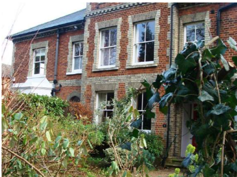
Picture 63. Nos. 1-3 Duncombe Road an important and prominent 19th century building that retains many of its original features most worthy of retention and protection.

5.125. Nos. 5-11 Duncombe Road. Group of early 20th century dwellings; slate/tiled roofs with prominent chimneys with pots. Some brick some render. Generally modern window replacements. Some vertical tile detailing. One plaque inscribed with date 1927 noted. An Article 4 Direction to provide protection for selected features may be appropriate subject to further consideration and notification.