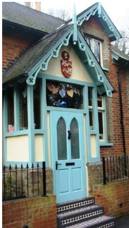
Picture 106. Ornate porch detailing to Warren Lodge.

5.239. Nos. 13-27 Chambers Street. Simple terrace dating from the early 20th century. Brick/painted brick/render with slate roofs, chimneys with pots. Common lintel detailing. Mix of traditional sympathetic/ historically inappropriate window types. A simply designed terrace of overall pleasing appearance despite some modern window replacements. An Article 4 Direction to provide protection for selected features may be appropriate subject to further consideration and notification.