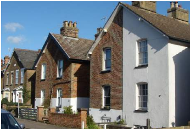
Picture 499. A mixture of render and brick, assumed to demark property ownership is visually disruptive.