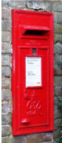
Picture 138. A George VI letter box, note more decorative lettering detail.

5.313. George VI letter box, Hagsdell Road. A more decorative intertwined lettering design when compared with earlier models.