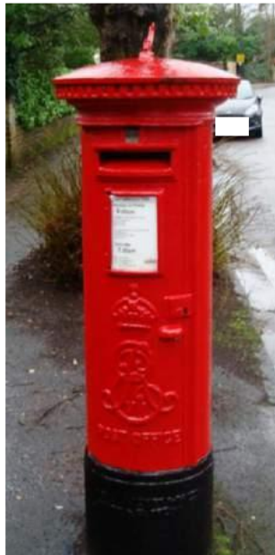
Picture 114. A fine example of an Edward VII pillar letter box that may once had a telephone directional sign on top.

5.256. Edward VII Pillar Letter Box, south side Warren Park Road. Pillar letter box from the brief reign of Edward VII with decorative royal cipher inscription below crown. Note broken element on top which may have been housing for a telephone directional sign.