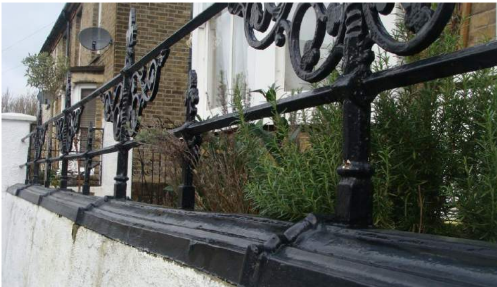
Picture 84. Very good quality early 20th century railings that are protected and which should be retained.

5.191. Traditional railings on wall dating from early 20th century to front of Nos. 45-51 Wellington Street.