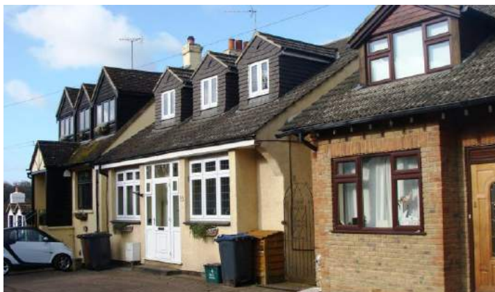
Picture 159. Examples of properties at Hillside Terrace proposed to be excluded from the Conservation Area.

(a) Buildings and land at Hillside Terrace. This is an area accessed by a narrow road and track and in the main consists of single storey bungalows generally of no historic interest or architectural value. The area to be excluded consists of: Preview, Watersmeet, Orchard Cottage and Nos.1-7 Hillside Terrace and adjacent land to west of No. 7.