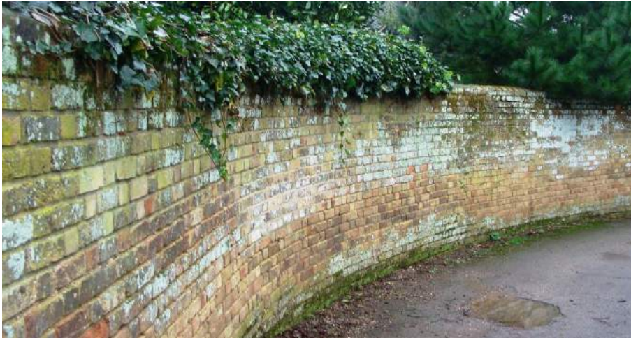
Picture 112. Attractive curved brick wall to Revels Hall. Adds to the quality of the street scene near St. Leonard's church.