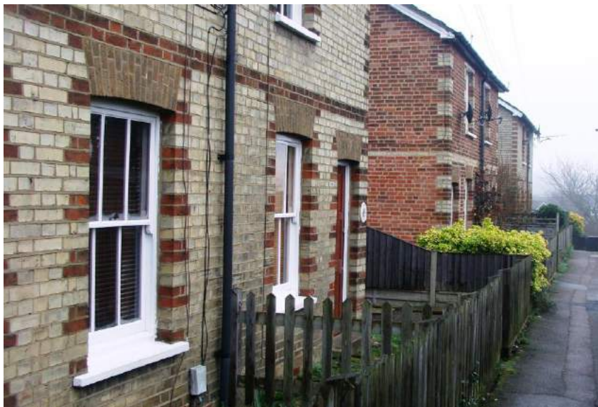
Picture 58. Nos. 3-8 Grove Walk - an attractive 19th century grouping largely unspoilt.

5.113. Nos. 3-8 Grove Walk. Three two storey pairs of 19th century cottages of yellow and red brick construction along narrow path, chimneys with pots. Early/sympathetic window detailing and common door types indicative of single ownership. An Article 4 Direction to provide protection for selected features may be appropriate subject to further consideration and notification.