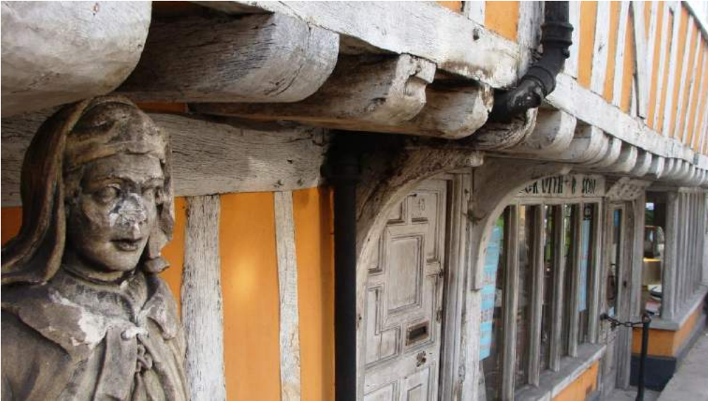
Picture 221. No. 43 St Andrew Street, a fine grade II* listed building dating from the 15th century.