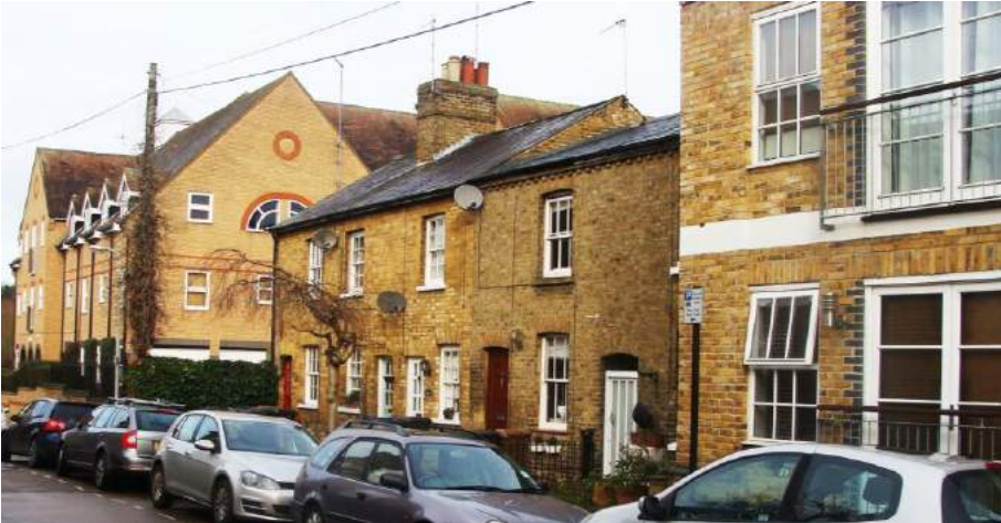
Picture 198. Priory Street an area of considerable redevelopment where the retention of this historic terrace is considered to be most important.

5.6. Throughout this large urban area there are parts which consist of 'neutral' mid 20th century buildings of limited historical or architectural interest. In many cases the decision has been taken to leave such areas within the Conservation Area on the basis that redrawing the boundary would create curious and contorted boundary revisions. The presence of such 'neutral' areas is inevitable in a town the extent and size of Hertford.