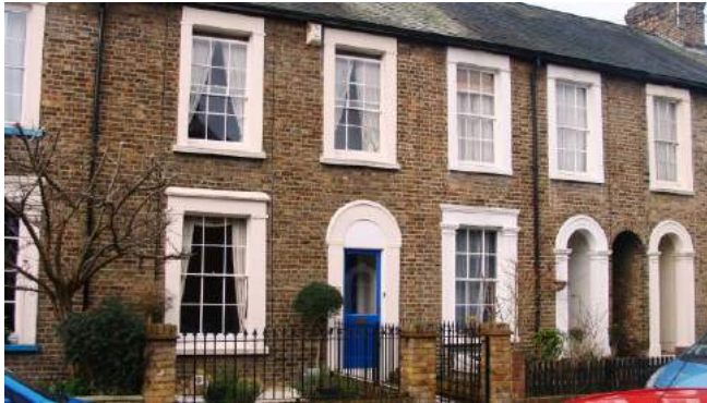
Picture 165. Nos. 25-39 Currie Street, an imposing 19th century terrace that makes a significant contribution to the street scene.

regrettably enclosed). A most attractive grouping most worthy of retention and preservation. An Article 4 Direction to provide protection for selected features may be appropriate subject to further consideration and notification.