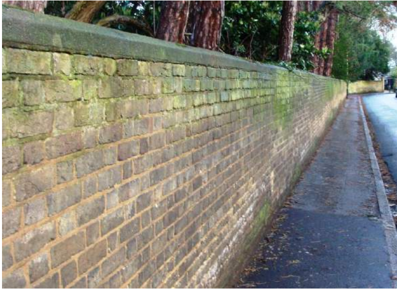
Picture 83. Long uninterrupted run of 19th century brick wall which makes a significant visual contribution to the quality of Byde Street.

5.190. Edward VII pillar letter box, corner of Elton Road/ Church Road.