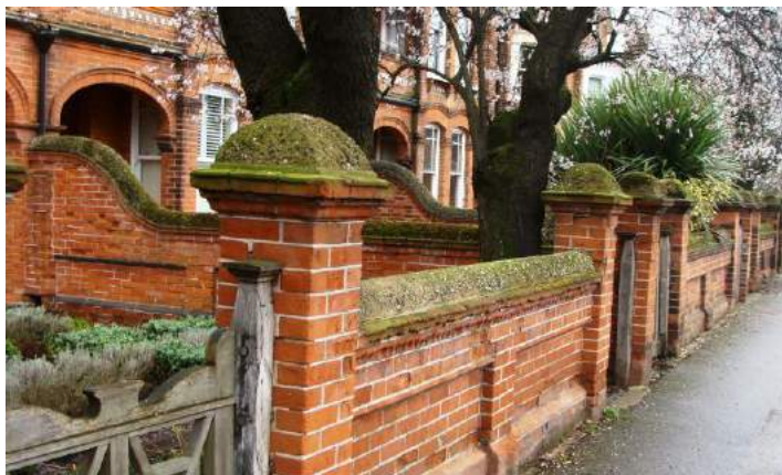
Picture 178. Good quality boundary and division walls to Nos. 111-115 Ware Road within the proposed extended conservation area.

5.426. Good quality boundary walls to front and forming right angle boundary divisions to Nos. 111-115 Ware Road. Worthy of retention and where appropriate an Article 4 Direction subject to further consideration and notification.