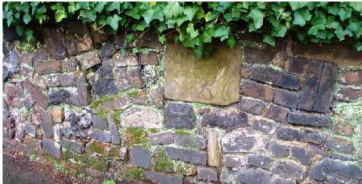
Picture 87. Interesting wall of random construction.

5.200. Length of low wall of random construction corner of Bengo Street and Warren Park Road.