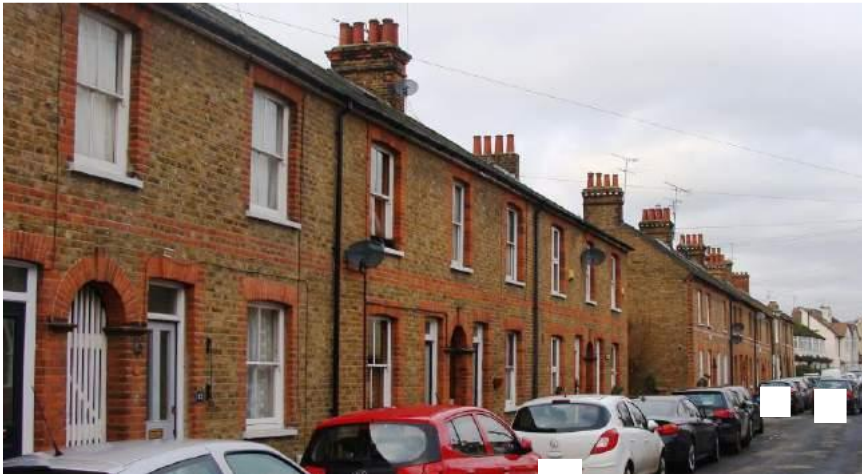
Picture 71. Molewood Road most attractive terraces of early 20th century date to the south side.

banding; rubbed lintels; regrettably some modern inappropriate replacements but many early/sympathetic remain. Arched entrance points to rear. A strong and attractive streetscape. An Article 4 Direction to provide protection for selected features may be appropriate subject to further consideration and notification.