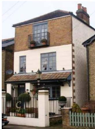
Picture 140. A highly personalised treatment of a three storey building in a 19th century street scene.