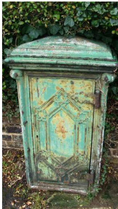
Picture 177. Unusual unidentified item corner of Ware Road/ Rowley's Road, possibly that of a utility company. Does the reader have any information?

5.425. Metal box, probably that of a utility company corner of Ware Road/ Rowley's Road.