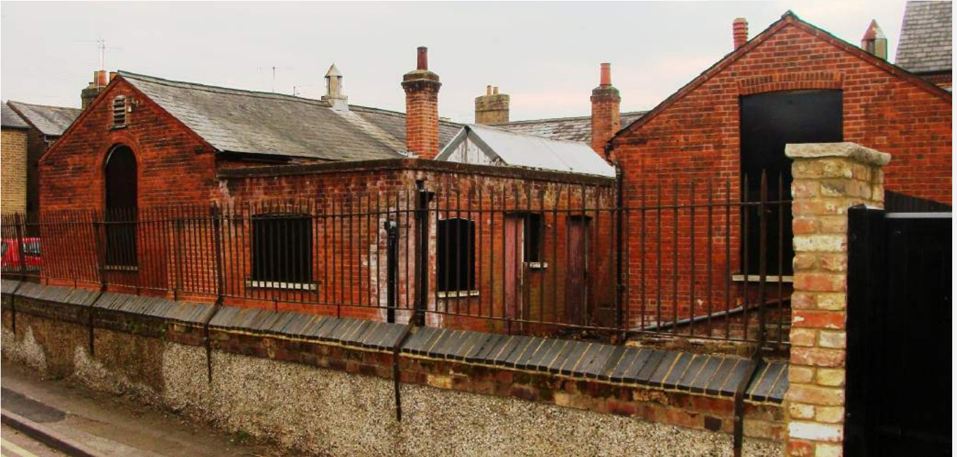
Picture 44. Part of a larger site at Dimsdale Street that is cause of concern and in need of further investigation before concluding its future.

5.81. Small untidy area to south side of Castle Street (opposite the Moat Garden, providing subway access). A small untidy area with signage advertisement signs and salt bin. Looks unattractive and uncared for. Proposals for its improvement are needed.