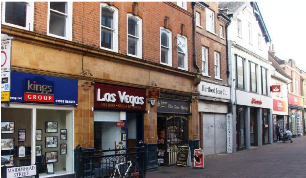
Picture 332. Maidenhead Street. This pedestrianised street in the centre of the town has the potential for improvement. Strident and discordant signage could be much improved when shops change occupation and new fascia advertisements are needed. Repaving as advocated by the Urban Design Strategy would be most beneficial.

5.45. It is noted that several shops are currently unoccupied. The pedestrianised surface of Maidenhead Street is beginning to deteriorate in places and its colour and material used are unremarkable. The presence of several vacant shops and discordant signage, results in a street scene that is less than satisfactory. It is considered Maidenhead Street has the potential for significant improvement that may be of interest to the local traders and other interested organisations.