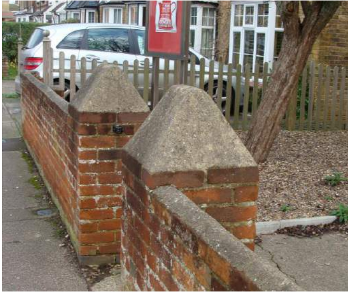
Picture 79. Brick wall to front of Bengoe Parish Hall which on balance is considered worthy of retention and additional protection subject to further consideration and notification.

5.184. Wall to front of No. 121 Bengoe Street ( The Yews ). A yellow brick wall of about 2m in height and prominent in the street scene.