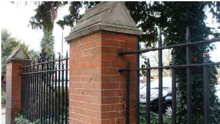
Picture 175. Prominent historic railings are important features surrounding what is now Tesco's car park.

5.423. Wall to Ware Road frontage of Tesco car park. Substantial railings on dwarf brick wall supported by piers surmounted by stone capping detail. Prominent and important in local street scene.