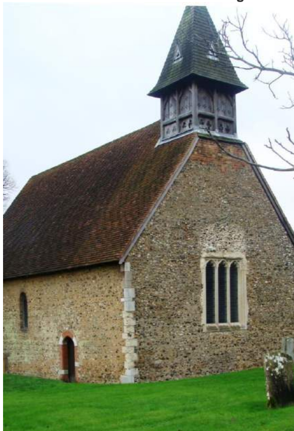
Picture 98. Church of St Leonard an ancient church dating from the 12th century with later alterations.

5.219. Church of St Leonard Grade 4 + . 12th century origin. Alterations 13th to 15th centuries. 18th century porch, late 19th and early 20th century restoration. Flint rubble with ashlar, clunch and Barnack stone long and short quoins and red brick stitching, traceried stone windows. Chancel windows, 13th century. Nave with 19th century collared roof, west end with arch bracing. 12th century chancel arch. Paintings on wall of chancel arch discovered 1938. The church was held by the de Tany family in the 12th century and was given to the Priory of Bermondsey, remaining their property until the Dissolution. The church passed to the Byde and Fanshawe families and in 1846 the Abel Smiths of Woodhall purchased the rectorial tithes and turned the living into a rectory.