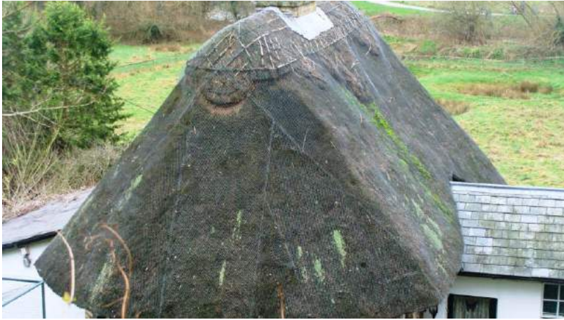
Picture 99. The Vineyard - thatched ridge appears in need of repair which may be eligible for EHDC grant assistance.

5.221. Hertford Baptist Church, church hall and attached railings, Cowbridge - Grade II. Non-conformist church, and attached hall. 1905-6. Red engineering brick, laid to Flemish bond with black pointing, with stone bands, dressings, windows and cupolas, beneath Welsh slated roof, with steep-profile red clay ridge tile in Perpendicular Gothic revival style with Arts and Crafts overtones. Cast-iron railings, with curved braced supports at intervals, and arches over spearheads and scroll and spade ties, run around western boundary of site where Cowbridge turns into Port Hill.