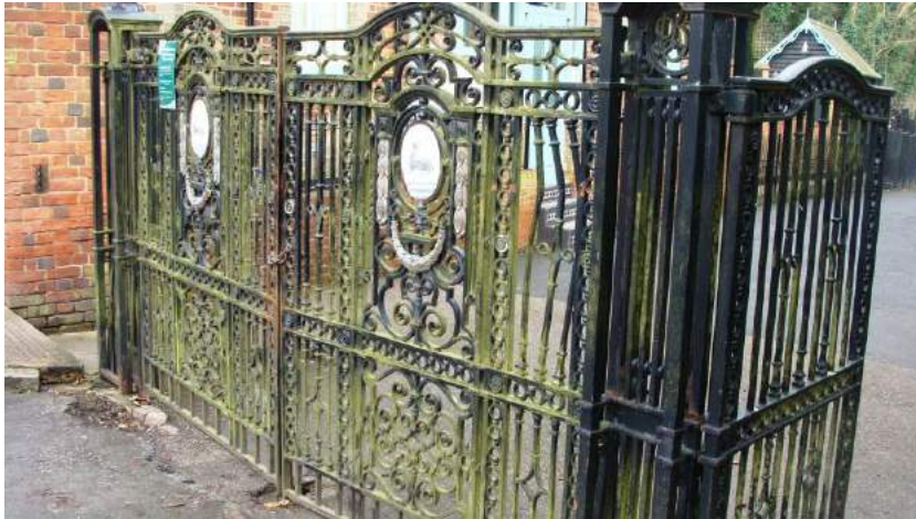
Picture 116. Decorative metal gates assumed to date from the earlier part of the 20th century are imposing and a strong feature in the street scene. Minor remedial works required.