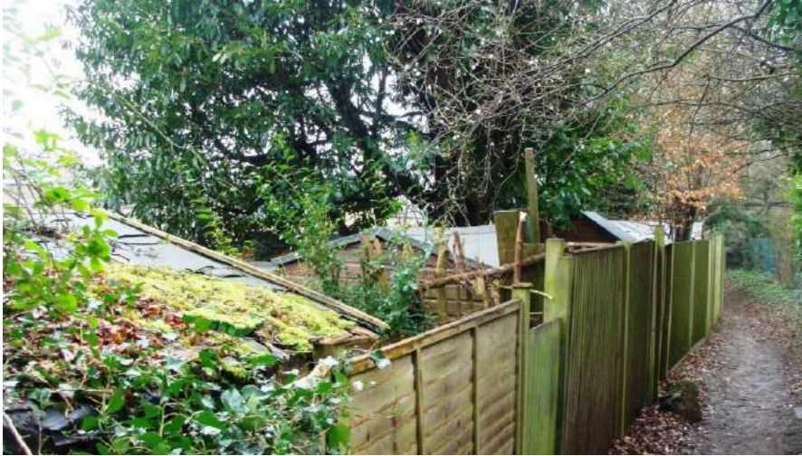
Picture 155. A mixture of fencing and dilapidated garden sheds in some locations adjacent to this public footpath detract.

5.366. Elements out of character with the Conservation Area. Selected rear garden sheds/fencing etc to some properties on West Street, particularly adjacent to public footpath running between the latter and County Hall.