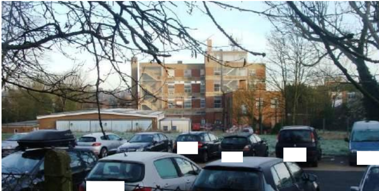
Picture 148. View across undistinguished site corner of Gascoigne Way and London Road. The commercial element may have some potential for long term redevelopment so as to improve this gateway site.