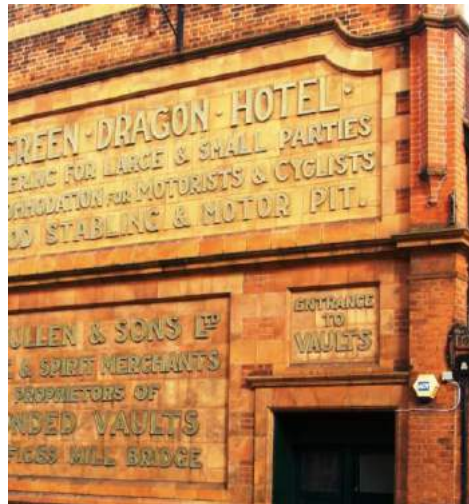
Picture 254. Early 20th century raised lettering on frontage to Green Dragon stabling, unusual.

5.22. Former stables to former Green Dragon Hotel - Grade II. Circa 1903-4, with late 20th century alterations. Architect James Farley. Bronze brick with terracotta dressings and ornament, clay tiled roof. Ground floor has brick plinth, with blank arches, terracotta band, and large terracotta panel with raised lettering.