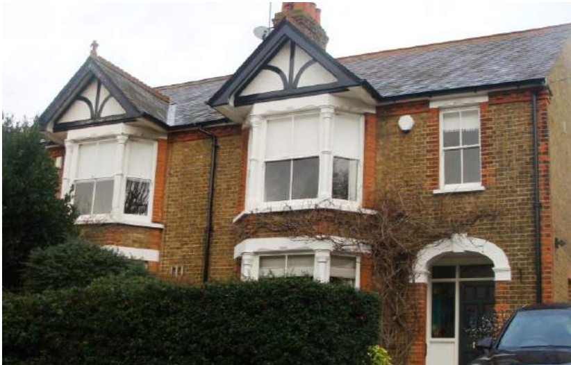
Picture 66. Good quality early/mid 20th century detailing to typical semi detached property on Church Road.

5.133. Nos. 6-32 Church Road. A variety of early/mid 20th century detached and semi detached dwellings. A combination of slate and tiled roofs with prominent chimneys and pots. Brick render and pebbledash. A considerable number of high quality original/early features including window detailing, vertically hung tiles, decorative wooden detailing, finials and recessed entrances. A high quality environment which is largely unspoilt. An Article 4 Direction to provide protection for selected features may be appropriate subject to further consideration and notification.