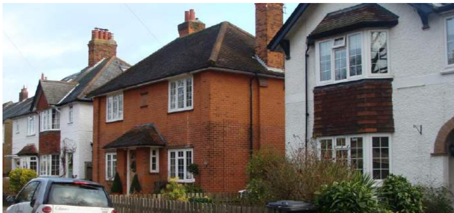
Picture 64. Despite modern window replacements these earlier 20th century properties make a positive contribution to the street scene.

5.125. Nos. 5-11 Duncombe Road. Group of early 20th century dwellings; slate/tiled roofs with prominent chimneys with pots. Some brick some render. Generally modern window replacements. Some vertical tile detailing. One plaque inscribed with date 1927 noted. An Article 4 Direction to provide protection for selected features may be appropriate subject to further consideration and notification.