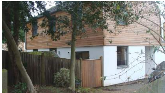
Picture 154-176. Modern housing design solutions in Hertford. First picture solution in traditional mode, next a more adventurous and contemporary solution; lower a contemporary/ traditional solution with simple and effective design detailing. In the fieldworker's opinion Hertford could accommodate more contemporary solutions.