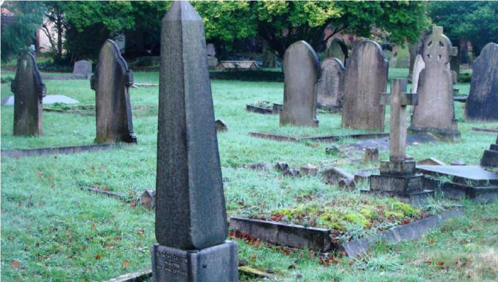
Picture 88. Holy Trinity churchyard - an important open space in a dense built up urban area that is well maintained containing traditional churchyard trees and gravestones dating from the 19th century.

5.203. Large tract of open space to east of Railway line, north of Beane Road and west of Molewood Road. An important open space through which runs the River Beane. The area represents a significant environment and visually attractive feature surrounded by urban development. Mature willow trees scattered through out. The land appears to be in private ownership and the fieldworker wonders if this is the case Is there any community interest in seeking to achieve public accessibility? Identified on the District Plan as one of the Hertford Green Fingers. Part also identified as a Wildlife site (see below).