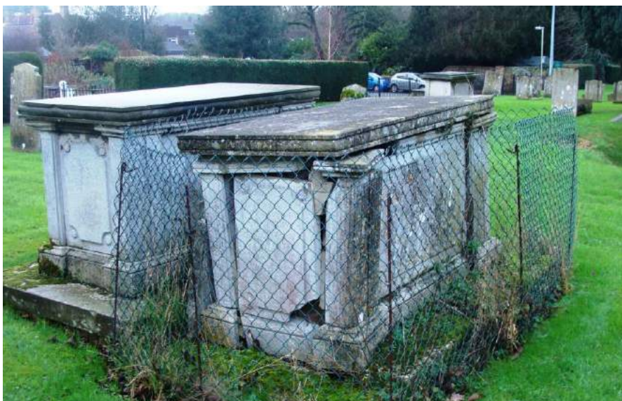
Picture 125. Damaged chest tomb at St. Leonard's churchyard in urgent need of repair which may be eligible for grant assistance from EHDC.

5.276. Suggested boundary changes. None are proposed in Area 3.