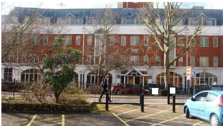
Pictures 184 Pictures 184-185. The WVRS building and Stag House part of the complex proposed for exclusion from the conservation area.