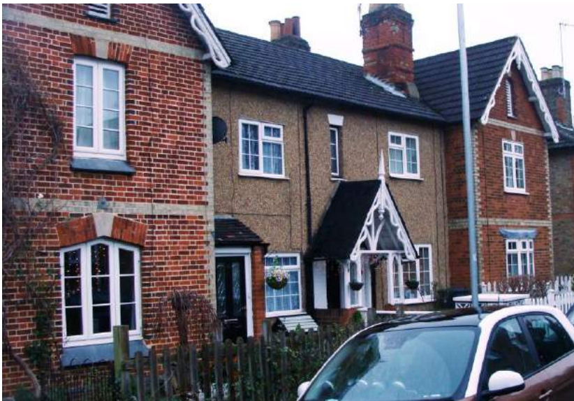
Picture 103. Nos. 9-18 Warren Terrace - a prominent grouping that provides visual and historic interest to this late 19th century street.

5.230. Nos. 9-19 Warren Terrace. Terrace of late 19th century two storey properties which are dominant in the street scene. Red brick with decorative brick detailing, pebble dash; chimney stacks with pots; decorative barge boarding and central decorative porch with steeply sloping roof and intricate wooden detailing. Some modern windows detract. Nevertheless overall mass and selected detail contributes to the street scene. An Article 4 Direction to provide protection for selected features may be appropriate subject to further consideration and notification.