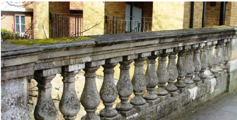
Picture 39. Nicely proportioned bridge and baluster detailing near Hertford Theatre.

5.66. Good quality stone bridge with baluster detailing to both sides of Mill Bridge.