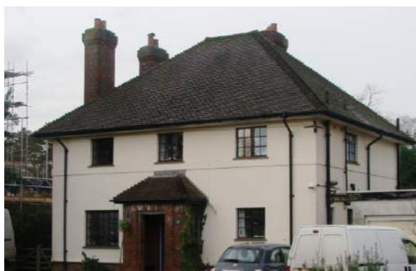
Picture 60. No. 17 Bengoe Street. Some mid/late 20th century properties representative of their age add interest and diversity to the street scene.

5.117. No. 17 Bengoe Street. Large detached mid/late 20th century dwelling. Render with tiled pyramidal roof and chimney stacks. Central entrance. Largely unaltered and representative of its era. An Article 4 Direction to provide protection for selected features may be appropriate subject to further consideration and notification.