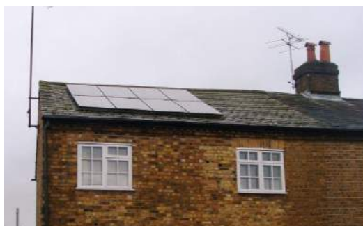
Picture 121. Thus far the visual impact of solar panels on historic houses is limited in Hertford but will this remain the case and if it does not what is the reader's views of introducing additional controls to restrict what is often 'Permitted Development'?