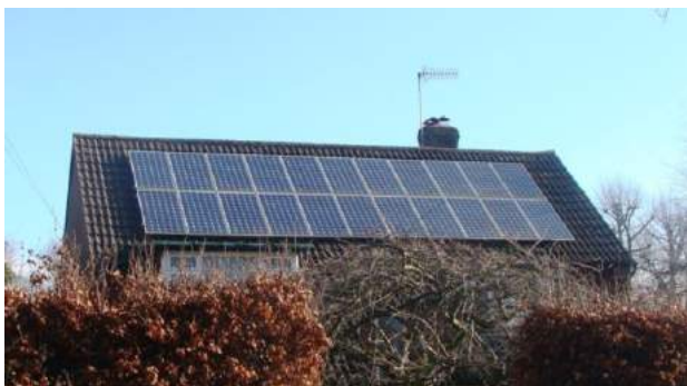
Picture 132. Another example of solar panel on a modern building in the conservation area.