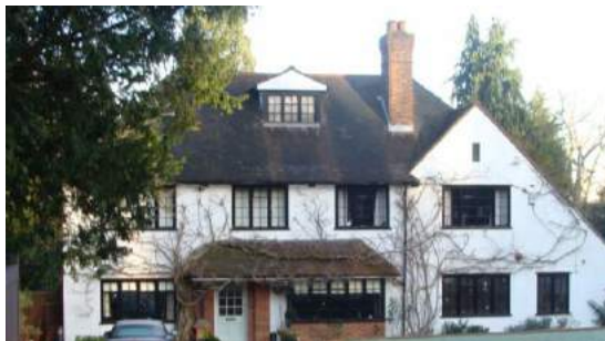
Picture 136. The Dell, Hagsdell Road - probably from first half of 20th century, nice proportions.

5.309. The Dell, Hagsdell Road. Large detached house probably dating from the first half of the 20th century. Render with tiled roof, tall chimneys with pots. Good window detailing. Typical of type and period. An Article 4 Direction to provide protection for selected features may be appropriate subject to further consideration and notification.