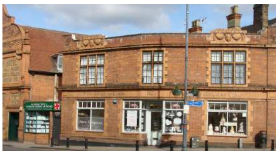
Picture 376. Pretty Gorgeous Cakes building, an interesting building with good decorative detailing, most worthy of retention.

5.48. Pretty Gorgeous Cakes, No. 8 Parliament Square. Two storey distinctive building of red brick construction with good window detailing to first floor including stone window surrounds and decorative drapery swags above. Normal development control administers alterations.