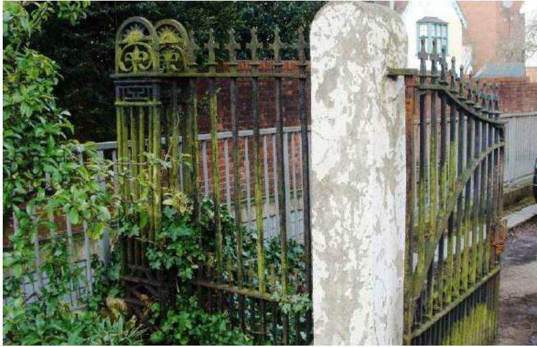
Picture 48. Listed gates etc end of Church Street in need of refurbishment.

5.86. Gascoyne Way car park. This long linear car park is extremely striking in the street scene whose unattractive visual prominence will be noticed by residents and visitors to the town alike. However it is well used and provides an essential parking provision, with a life expectancy of at least 20 years, following an expensive refurbishment in 2010/2011. In the short to medium term, it is here to stay. Can its rather unattractive appearance be reduced? In this respect a key unattractive feature is its linear nature which if broken up might result in improvements. One solution might be planting 'green walls' on selected vertical elements of the structure; another might be repainting using different colours to provide some vertical emphasis. Substantial tracery tree planting in the narrow strip between the car park and carriageway is worthy of exploration but might well be impractical because of the existence of essential services. Resolving the problem will not be easy and it is considered high quality urban design advice will be necessary. Attaining the latter is proposed.