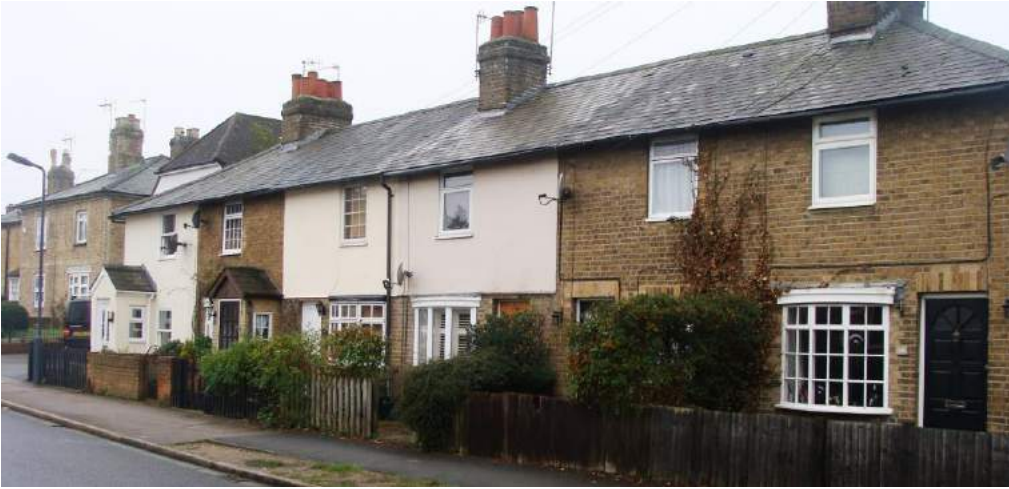
Picture 43. A terrace within the town where various window and porch types together with painting of brick work have altered the original visual harmony and historical integrity of the group.