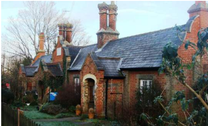
Picture 129. Typical almshouses with attractive chimney detail.

5.284. Harrison Almshouses - Grade II. Almshouses, originally a block of 6 but now refurbished as 3. Dated 1854, with 20th century alterations. Red brick, Flemish bond, with cream brick dressings, Welsh slated roof with single and double diagonally shafted chimneystacks with band and oversailing cap.