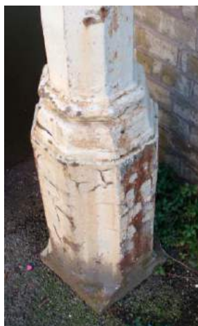
Picture 117. Detail of base of early street lamp on Chambers Street in need of refurbishment. Several of these have been noted.