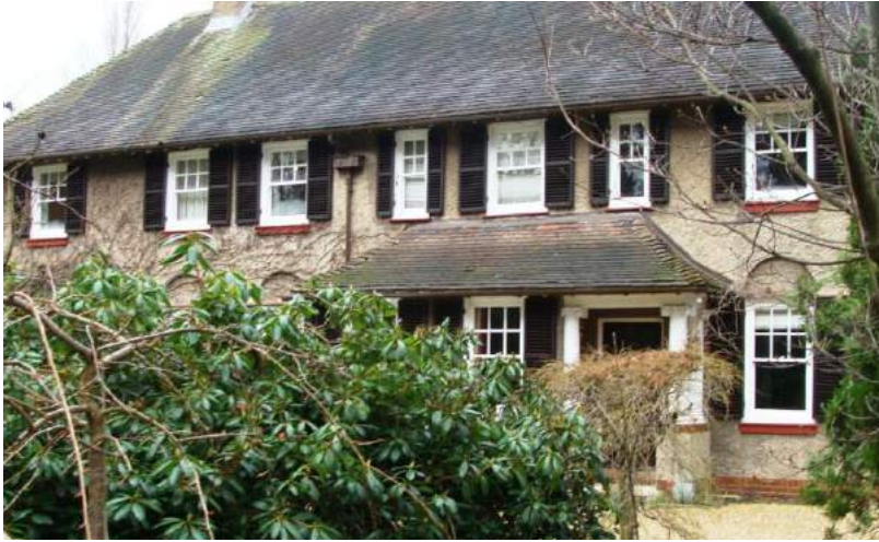
Picture 65. Wisteria Place, a large 20th century detached residence of quality and distinctive unusual design.

5.133. Nos. 6-32 Church Road. A variety of early/mid 20th century detached and semi detached dwellings. A combination of slate and tiled roofs with prominent chimneys and pots. Brick render and pebbledash. A considerable number of high quality original/early features including window detailing, vertically hung tiles, decorative wooden detailing, finials and recessed entrances. A high quality environment which is largely unspoilt. An Article 4 Direction to provide protection for selected features may be appropriate subject to further consideration and notification.