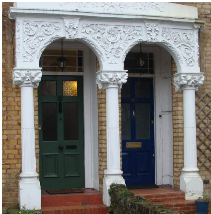
Picture 135. Highly decorative late 19th century detailing to properties west side of Queens Road.

protection for selected features may be appropriate subject to further consideration and notification.