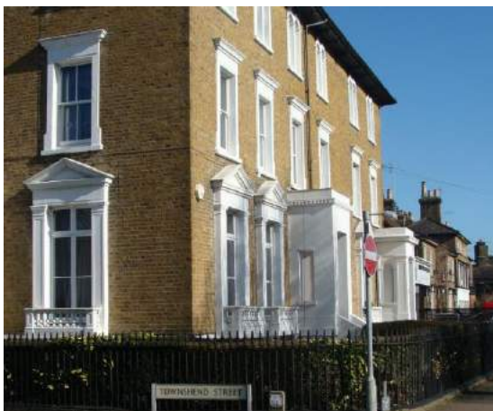
Picture 168. Very fine unspoilt building corner of Ware Road and Townshend Street that makes a most imposing presence in this part of the conservation area.

5.403. Nos. 19/19A Ware Road and No. 2 Townshend Street . A tall three storey yellow brick building probably dating from the late 19th century. Slate roof and chimneys. High quality window detailing, imposing entrances and deep eaves detailing. A very fine building which if not flats, should be protected by Article 4 Direction subject to further consideration and notification.