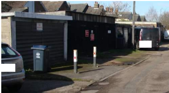
Picture 180. Garaging Davies Street. Is there any interest in negotiating some improvements here?

5.433. Opportunities to secure improvements. Discuss further the potential of improving the visual appearance of garaging at Davies Street. Seek to secure repairs to the signal box located just beyond the conservation area near Railway Street (see picture above).