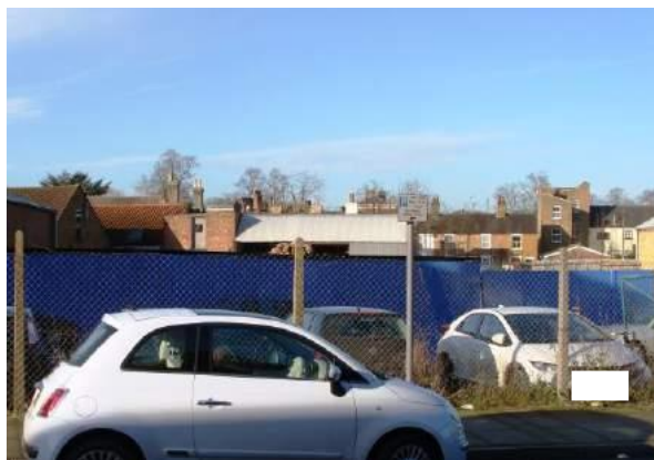
Picture 124. Untidy site opposite The Hertford Brewery, an iconic Hertford landmark. This site is in urgent need of appropriate redevelopment. Planning permission has been granted.

5.274. Large untidy site opposite The Hertford Brewery listed building, one of Hertford's iconic landmarks. This site seriously detracts from one of the town's iconic landmarks and adjoins another, namely the Ekins & Co. listed building. The site is bounded by untidy fencing supported by concrete posts parked vehicles and signage. Permission has been granted and appropriate redevelopment of this site is highly desirable.