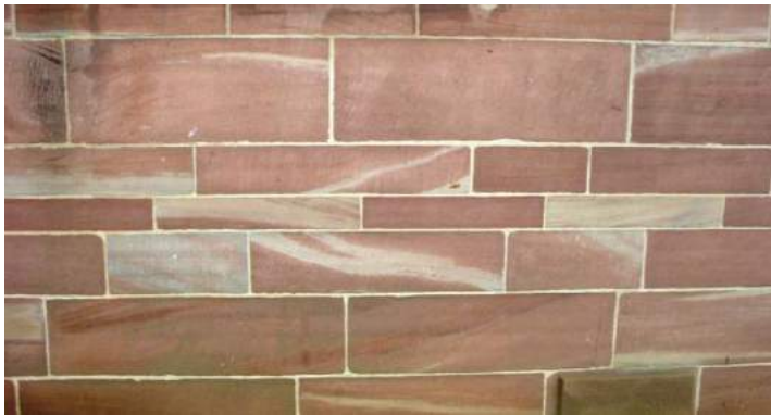
Picture 126. Beautiful external sandstone detailing of All Saints.

5.281. Church of All Saints with St John - Grade II* ( All Saints ). Parish church. 1893-95, replacing earlier building destroyed by fire in 1891, west tower added 1905, Memorial Chapel completed 1934. Architects Paley, Austin and Paley of Lancaster. Of pink Runcorn sandstone with plain clay tiled and lead roll roofs in Northern Gothic Revival perpendicular style. All Saints Parish dates from prior to the 10th century and in the 11th century was joined with the Liberty of Brickendon which was held by Waltham Abbey under a charter from Edward the Confessor. The 'old' All Saints church had been rebuilt in the 15th century but caught fire in December 1891 and was completely gutted. The tower was completed in 1905, as the Victoria Tower in memory of Queen Victoria. The Memorial Chapel was dedicated in 1934.