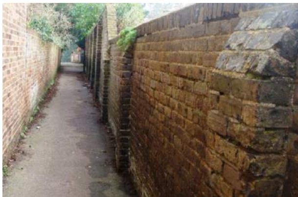
Picture 85. Walls enclosing public footpath 85.

5.192. Brick walls various locations opposite Byde Street (including public footpath 85 to Bengoe Street). Various heights. Add interest particularly to footpath access.