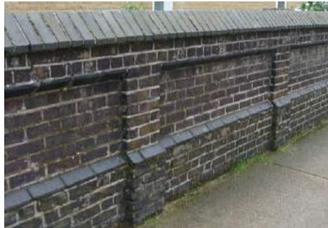
Picture 174. Dark brick wall with triangular capping detailing.

5.422. Dark brick wall with triangular capping detailing - corner Currie Street/ Talbot Street. Properly retained to enclose later development.