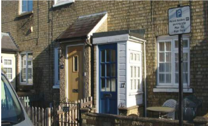
Picture 98. Inappropriate porch detailing.