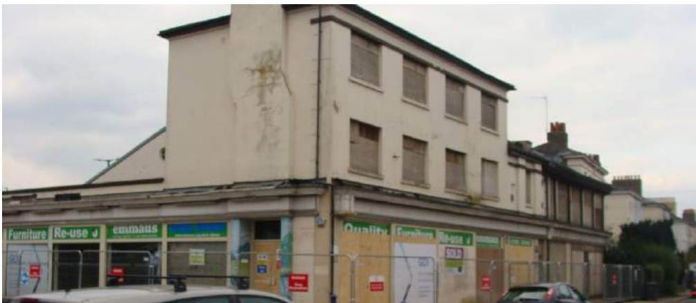
Picture 43. A most unattractive site where improvements should occur when the planning permission is implemented.

5.79. Noble car parking site corner of Neil Neal Court and North Road. An untidy site with unattractive signage. Planning permission has been granted for development.