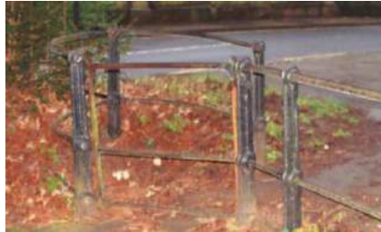
Picture 142. Boundary railing detail and entrance point to All Saints churchyard, south western corner.

5.317. Railings and entrance point, South west boundary All Saints churchyard and nearby bollard. Probably of 19th century date. Constructed of 2 No. horizontal railings supported by metal posts about 2m centres.