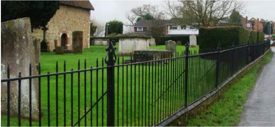
Picture 113. Attractive railings probably of mid 20th century date but which make a very positive contribution to the street scene in this location.

5.256. Edward VII Pillar Letter Box, south side Warren Park Road. Pillar letter box from the brief reign of Edward VII with decorative royal cipher inscription below crown. Note broken element on top which may have been housing for a telephone directional sign.