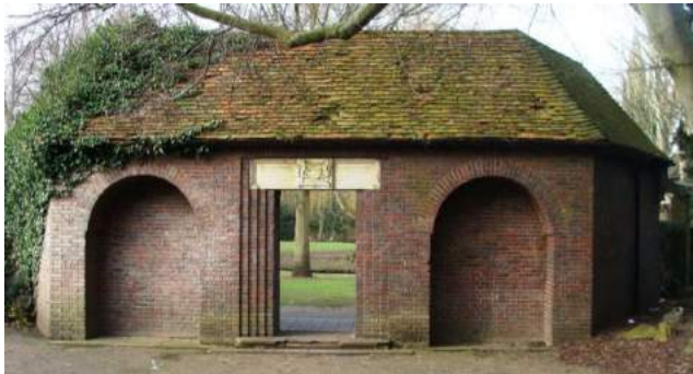
Picture 298. The commemorative pavilion in the grounds of Hertford Castle. It is unacceptable the building remain in its current condition in the public realm. A decision is needed now.

structure on which to grow. The building is in a deteriorating condition and is in need of renovation. It is understood there are conflicting views concerning its future, with some favouring its removal whilst others consider its repair to be most appropriate. Whichever of these views may prevail it is unacceptable that the building remains in its current dilapidated condition. It has a certain charm and historical association and a case exists for its retention.