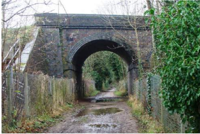
Picture 81. Bridge forming part of Enfield and Stevenage Loop Line.

5.188. Metal plaque near No. 4 Fanshawe Street whose lettering is interpreted as reading Hertford Municipal Borough Boundary the alignment of which appears in this location on the 1874-1894 mapping.