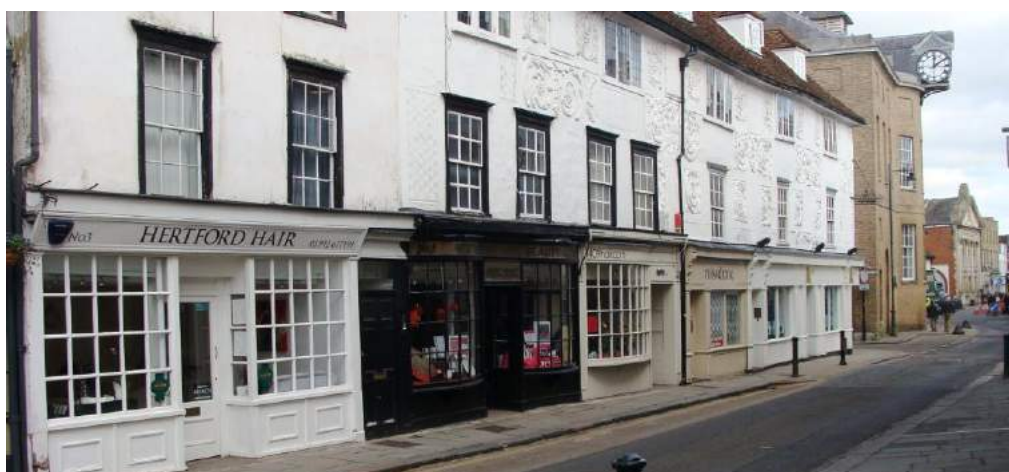
Pictures 343-354. Compare the quality of fascia design in these two pictures.

5.47. Bull Plain. Prominent group of commercial properties, south west corner of Bull Plain. Late 19th/ early 20th century in appearance. Three storeys in