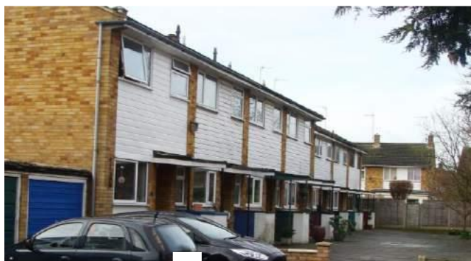
Picture 183. Mid/late 20th century properties proposed for exclusion from the conservation area.

(c) Exclude small area to south side of Ware Road to better reflect existing geography (previous alignment bisected the Nuffield Health building).