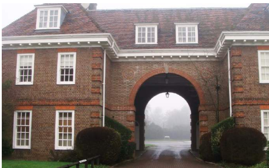
Picture 57. Bengoe Mews as it is today. Arch provided in later 20th century to provide access to rear.

5.111. Nos. 154-158 Bengoe Street. Group of late 19th century cottages of yellow brick construction with slate roof and chimneys (one a replacement). Modern replacement windows but similarity of design reduces impact. Distinctive lintel detailing. On balance the mass of this group makes a positive contribution to the street scene. Central window to first floor bricked up. An Article 4 Direction to provide protection for selected features may be appropriate subject to further consideration and notification.