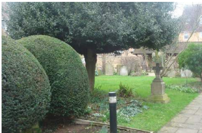
Picture 122. St Joseph's churchyard, St John's Street, a delightful small space in a densely built up area.

5.265. The churchyard of Our Lady and St. Joseph, St. John's Street. A small open space in a dense urban area with gravestones. Site of former Benedictine Priory. Traditional churchyard trees.