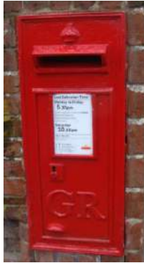
Picture 137. GR wall mounted letter box, an iconic item of British identity.

5.313. George VI letter box, Hagsdell Road. A more decorative intertwined lettering design when compared with earlier models.