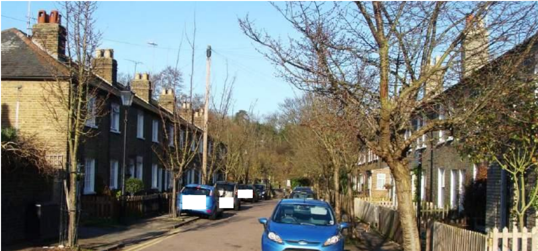
Picture 109. The delightful late 19th century area of Folly Island.

5.245. Nos. 8-20 St. John's Street. Late 19th century two storey terrace of yellow brick construction with red brick banding; slate roofs with prominent chimneys. Occasional porch detail detracts. All good quality early/sympathetic window detailing. An Article 4 Direction to provide protection for selected features may be appropriate subject to further consideration and notification.