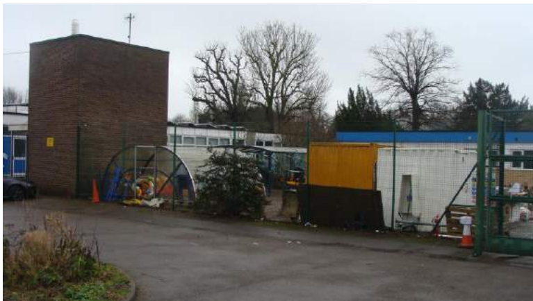
Picture 95. Part of Millmead school site detracts from quality of the conservation area and would benefit from comprehensive improvements.

5. 210. Millmead school Port Vale. In part an unattractive site and boundary detailing that detracts from the quality of the conservation area in this location. Would benefit from comprehensive improvements.