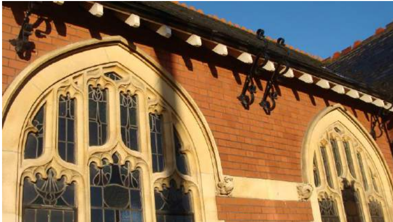
Picture 100. A finely detailed early 20th century listed building - the Hertford Baptist Church, Cowbridge.

5.221. Hertford Baptist Church, church hall and attached railings, Cowbridge - Grade II. Non-conformist church, and attached hall. 1905-6. Red engineering brick, laid to Flemish bond with black pointing, with stone bands, dressings, windows and cupolas, beneath Welsh slated roof, with steep-profile red clay ridge tile in Perpendicular Gothic revival style with Arts and Crafts overtones. Cast-iron railings, with curved braced supports at intervals, and arches over spearheads and scroll and spade ties, run around western boundary of site where Cowbridge turns into Port Hill.