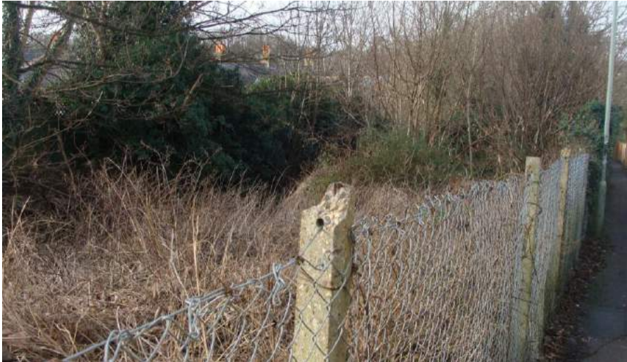
Picture 94. Former railway line now abandoned overgrown and untidy. What views does the community have regarding its future?

5.209. Overgrown and untidy open space being part of former railway line to the south east of Nelson Street. This site is untidy and overgrown. What is its future? It is no exaggeration to observe that some of the nearby streets are overwhelmed by traffic and parked cars. Could the site assist in this regard for example? It is suggested proper research be undertaken exploring all options. Leaving it in its current condition is not an option however.