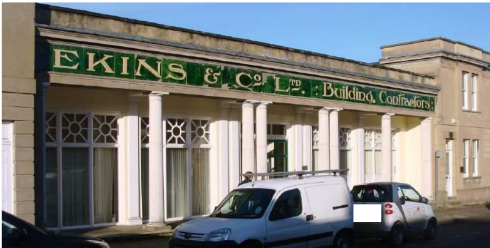
Picture 101. A fine early 20th century listed building on Hartham Lane.

5.223. Great Northern Works, Hartham Lane - Grade II. Former furniture showroom circa 1905. Brick covered by stucco and artificial stone, Welsh slated and flat roofs behind parapet. Centre has arcade with stucco Tuscan columns forming loggia. Built as commercial premises on the approach to the former Cowbridge Station (demolished circa 1980), the building takes its name from the Great Northern Railway which served Hertford from 1858. It became the headquarters of a local building contractor, Ekins & Co shortly after its construction.