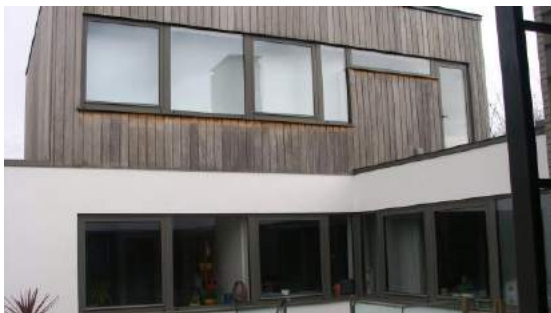
Picture 143. Hide House Railway Place. Hide House 2B Railway Place. A modern 'eco' solution. The owner advises this house is super insulated with some green roof space. Solar panels, air source heat pump system, heat recovery system and controlled lighting. John Pratley, Building Futures Awards Judge, said: "Hide House is an interesting attempt to construct a low energy home at a reasonable cost. The owners have created a house which makes excellent use of daylight and provides very good use of the available land on a very constrained site. The owners should be congratulated for designing and building a very attractive home on a very difficult to exploit site."