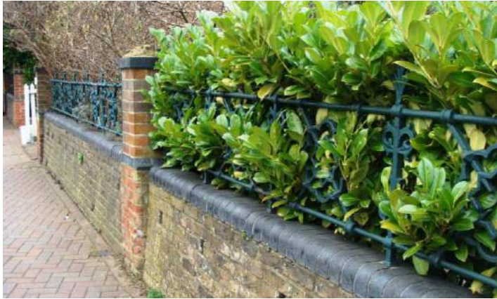
Picture 38. Good quality railings that extend along frontages of Nos. 60-90 Hertingfordbury Road.