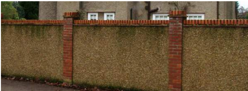
Picture 80. Unusual 20th century wall detailing to Wisteria Place.

5.186. Brick wall to Duncombe Road frontage and return to No. 2 Church Road (Wisteria Place). Brick piers, pebble dash panels, unusual.