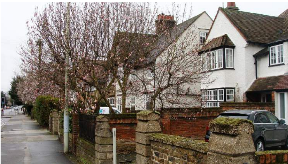
Picture 170. The eastern extent of the proposed extension to the conservation area on Ware Road comprising of mixed 20th century housing of pleasing design with trees to the frontages combine to create a quality environment.

5.411. Nos. 111-159 Ware Road (excluding Nos. 127-129 necessary correction to be consistent with mapping): Large large 20th century properties of various types and designs. Tiled roofs and slate roofs with chimneys. Various brick, render and pebbledash. Some box shaped windows to both floors. Barge board, finial, decorative eaves detailing and date plaque 1907 noted. Some three storey with decorative detailing, balconies. Nos.111-115 have fine boundary walls. Some properties are flats. An Article 4 Direction to provide protection for selected features on conventional residential properties may be appropriate subject to further consideration and notification.