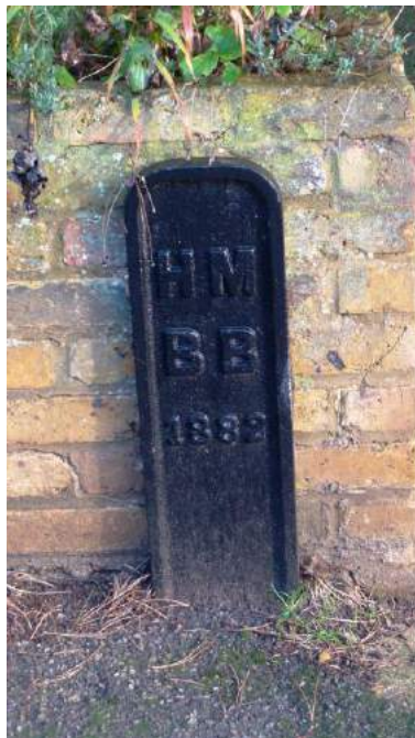
Picture 82. Interpreted as being a 19th century boundary marker for Hertford Municipal Borough.

5.188. Metal plaque near No. 4 Fanshawe Street whose lettering is interpreted as reading Hertford Municipal Borough Boundary the alignment of which appears in this location on the 1874-1894 mapping.