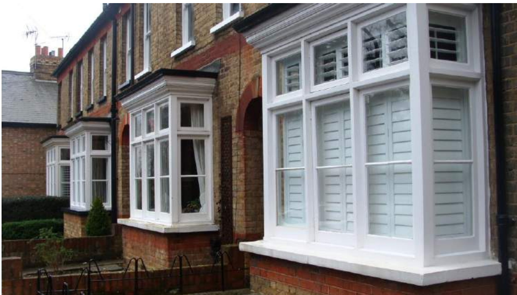
Picture 67. Nos. 15-21 Elton Road, part of a street that has retained many early features of quality.

5.136. Nos. 1-25 Elton Road. Of late 19th and early 20th century date. Two storey terraces semi detached and detached dwellings with slate roofs and prominent chimneys with pots. Many good architectural features including decorative ridge detailing, recessed entrances, bay windows with scalloped slate detailing over. Fine box shaped bay windows and many early/original windows of traditional design. An Article 4 Direction to provide protection for selected features may be appropriate subject to further consideration and notification.