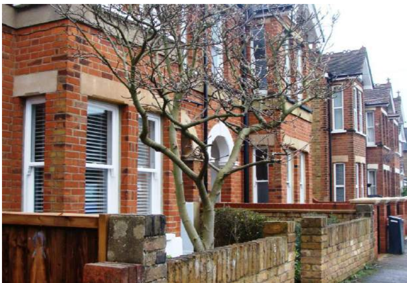
Picture 69. Good quality bay window detailing and recessed entrances, Fanshawe Street.

5.141. Nos. 1-37 Fanshawe Street. Late 19th/early 20th century housing, detached, semi detached and terraced. Slate roof with chimneys and pots. Variety of window types including bay windows to both ground and both floors. Particularly fine window detailing to No.33. Nos. 7-17 strong feature in street scene with canopies and detailing to upper windows. Some replacement windows. An Article 4 Direction to provide protection for selected features may be appropriate subject to further consideration and notification.