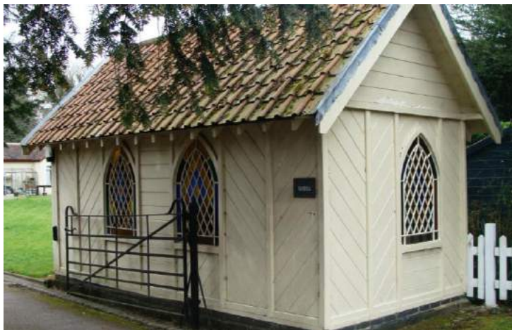
Picture 2019. Charming Gazebo in Gothick style, listed Grade II but no longer in original location.

5.16. Gazebo in grounds of Rockall, North Road. Grade II. Gazebo. Circa 1830-40, restored early 1990s. Timber-framed, with timber cladding, and a pantiled roof. Gothick style. The building was originally sited in the garden of No.2 North Road.