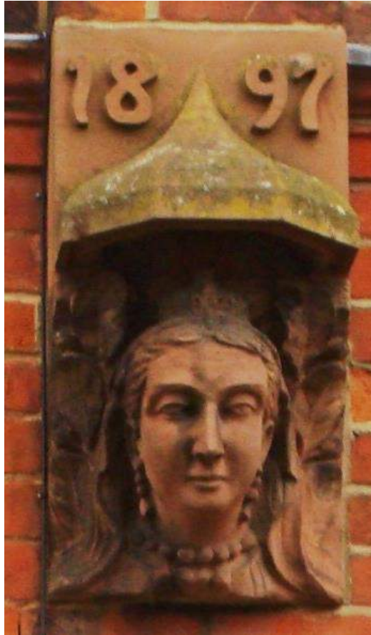
Picture 166. Bust interpreted to be of Queen Victoria dated and commemorating her Diamond Jubilee.

interpreted as being portrait of Queen Victoria commemorating her Diamond Jubilee. One property is a Dental Clinic. An Article 4 Direction to provide protection for selected features on residential properties may be appropriate subject to further consideration and notification.