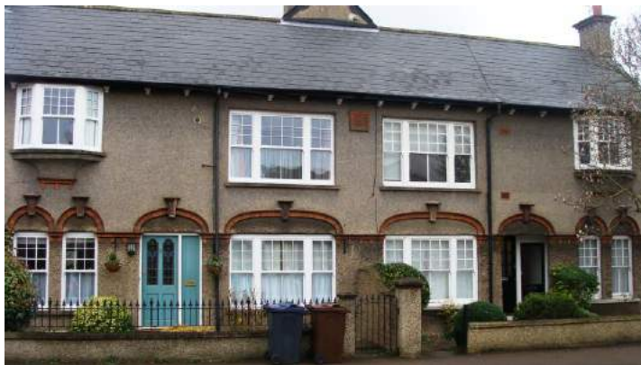
Picture 172. An unusual and attractive early 20th century group being Nos. 9-11 Fairfax Road.

5.415. Other distinctive features that make an important architectural or historic contribution. Walls and railings so identified are protected to varying degrees virtue of exceeding specified height relevant to the conservation area legislation or by being within the curtilage of a Listed Building unless otherwise noted.