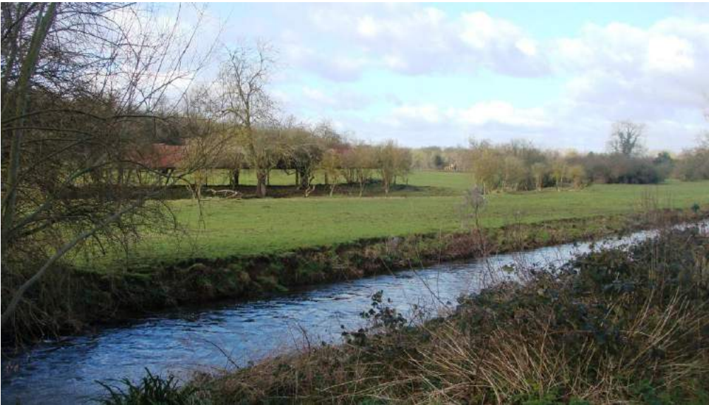
Picture 154. Part of the extensive area of highly attractive open land to the east of the railway and west of Tanners Crescent housing area, a significant environmental asset to the town and conservation area.

5.359. The extensive area of open land to the east of the railway line extending south to Hornsmill Road, surrounding Hertford football club and extending as far east to Gascoyne Way. The area is traversed east to west by the well used footpath, Cole Green Way. Also includes allotment land. Most of this site is designated as a Hertford Green Finger. It is traversed by the River Lea and consists in the main of grassland and trees.