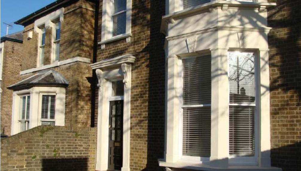
Picture 107. Fine town houses on Cowbridge whose visual contribution to the street scene is considerable, both in terms of mass and detail.

(excluding flats) for selected features may be appropriate subject to further consideration and notification.