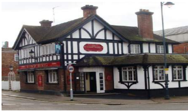
Picture 37. The decorative Lord Haig PH