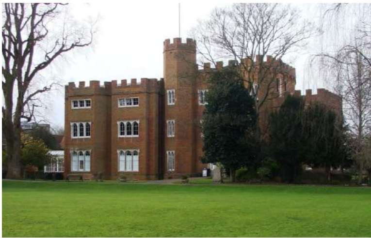
Picture 232. Hertford Castle listed Grade 1.

5.21. Hertford Castle Bailey Walls - Grade II*. Curtain wall along north-east side of Castle Bailey. Late 12th century with later repairs and alterations. Flint rubble with clunch blocks, and extensive repairs and rebuilding in red brick laid to English bond. At south-east corner is a screen totally rebuilt in red brick. The wall attains its greatest height of 15 -18 ft, without later crenellations. Also south-east range along south-east side of Castle Bailey of similar date.