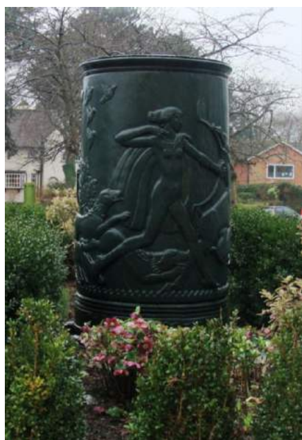
Picture 151. Bas relief drum to front of County Hall.

5.339. Forecourt to County Hall including bas relief drum, lamp posts and boundary marker - Grade II. External sculpture, lamp posts, gate piers and boundary curb. 1938-9. Architects as above. Bas relief cast-iron drum, with figure of Diana the Huntress, harts and hounds stands on York stone paving adjoining the Members' car park outside the main entrance portico of County Hall: Lamp posts purpose designed with bronze lanterns with conical copper tops. The gateways are flanked by dwarf Portland stone octagonal piers with moulded caps; Portland stone moulded boundary curb with steles at intervals. Several of the listed lamp posts have lantern missing which should be replaced.