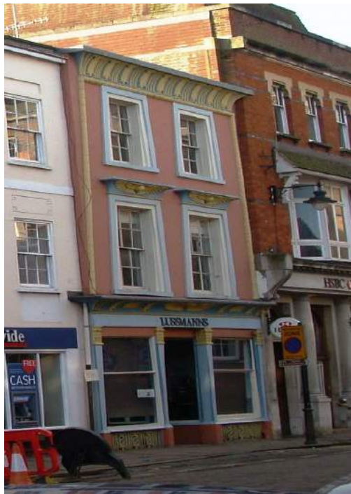
Picture 287. No. 42 Fore Street, a building in the Egyptian Revival style fashionable at the time of the Egyptian campaigns in the Napoleonic Wars.

5.26. No. 42 Fore Street - Grade II*. Circa 1825, with late 19th/20th century alterations. Stuccoed front, yellow-grey stock brick rear, with plastered second floor. 3 storeys late Georgian urban facade overlaid with modelled stucco decorative motifs, with a ground floor timber shop front of the same style. Tapered roll mouldings outline a full-height pylon across the elevation, with a bold cavetto cornice enriched with modelled scarabs. First and second floors have recessed 12-pane sash windows. Ground floor has original Egyptian style shop front, substantially unaltered save for the late 19th century substitution of large plate-glass sashes for the original small-paned display windows. The Egyptian Revival became fashionable at the time of the Egyptian campaigns in the Napoleonic Wars. The opening of William Bullock's Egyptian Hall in Piccadilly in 1812 sparked a series of Egyptian style buildings. Most of the urban buildings in the Egyptian style built over the next two decades, including this Hertford building, can be traced to The Egyptian Hall. A polychromatic colour scheme was installed during the 1980s following the example of The Egyptian House in Penzance (circa 1835).