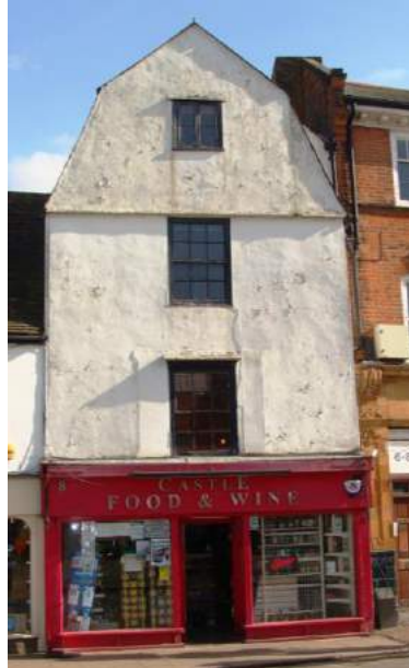
Picture 46. Upper floors to No. 8 The Wash in need of refurbishment.

5.83. No. 8 The Wash a listed building in need of renovation/redecoration. The upper floors detract from this part of the conservation area.