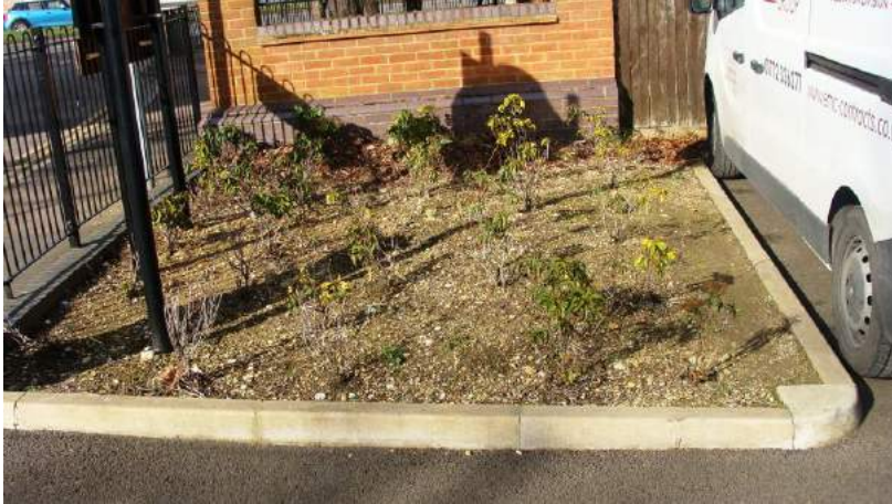
Picture 182. One of several potential areas within the car park where tree planting could provide additional height and replace low shrubs whose visually contribution is limited.

5.435. Although proposed for exclusion from the conservation area it is suggested additional landscaping could benefit the EHDC car park corner of Ware Road and London Road. Trees of appropriate species to provide height and additional screening could make improvements in the longer term.