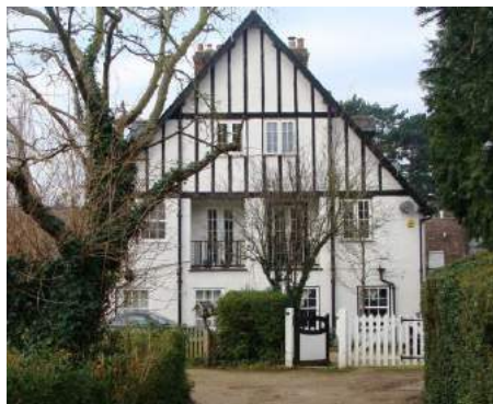
Picture 72. Nos.10-12 off Farquar - Farquhar Street an interesting building probably dating from the 1920's.

5.155. Nos.10-12 off Farquar - Farquhar Street. A tall 20th century building that appears in this location on the 1920-24 mapping. Very tall building of render with areas of decorative wooden detailing. Steeply sloping roof with chimneys. A visually interesting building.