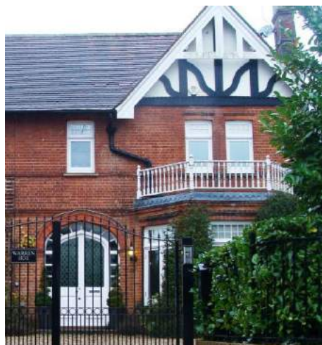
Picture 53. Warren Hoe, Warren Park Road - good quality detail worthy of retention. A late 19th century detached property, during which period it was located opposite a cricket pitch which existed at that time.

5.103. High Mead, Warren Park Road. Large detached 19th century residence. Two storey of brick construction with slate roof and chimneys. Decorative finials and barge board detailing. Bay windows with slate roofs to front. An Article 4 Direction to provide protection for selected features may be appropriate subject to further consideration and notification.