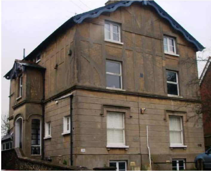
Picture 105. Nos. 18-20 Ware Park Road New Road . An unusual building of quality in this part of the Conservation Area.

5.235. Nos. 22 - 24 Ware Park New Road . Two storey late 19th century pair of yellow brick construction with pyramidal slate roof; central chimney with pots. Stone quoin and other stone detailing including window surrounds and scrolled hood moulds. Entrances set back to both sides. An Article 4 Direction to provide protection for selected features may be appropriate subject to further consideration and notification.