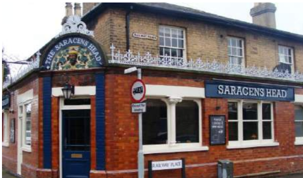
Picture 162. The Saracen's Head PH, a colourful listed building adding character to the street scene.

5.376. The Saracen's Head Public House, Ware Road - Grade II. Mid 19th century, extended late 19th century. Yellow stock brick, Flemish bond, ground floor orange-red glazed brick, Flemish bond. Hipped Welsh slated roof. The 'Saracen's Head' was probably built as a house.