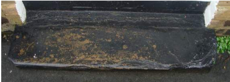
Picture 76. A well worn slate step to Port Vale terraced house.

An Article 4 Direction to provide protection for selected features may be appropriate subject to further consideration and notification.