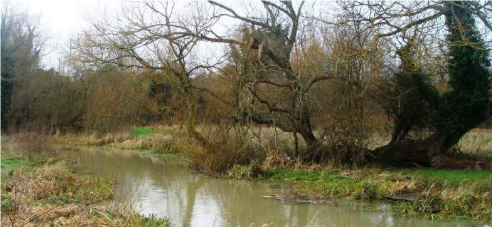
Pictures 89-90. Attractive open space between railway and Molewood Road crossed by the River Beane. Is there any interest in considering public accessibility?

5.204. Large tract of open space to the south west of Millmead Way and playing field to east. This extensive area is more formal in character to the above but nevertheless can be considered as an important area of open space which together with the river forms part of the special character of the town. During survey work the fieldworker received a local representation regarding the detrimental effect of ivy on many of the trees in this much used open space. The Millmead Way development itself is modern but of a coordinated design which reflects the characteristics of the nearby late 19th/early 20th century developments. In itself it is of generally pleasing design for its period and whilst but cannot be considered of special architectural or historic interest. It is located in a key location adjacent to a well used open space network. Its removal from the conservation area could not be achieved without very odd boundary consequences. On balance therefore no changes to the boundary in this location are proposed.