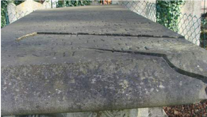
Picture 128. 18th century Benson tomb in need of repair. Potential candidate for entry Now included - on the Council's Heritage at Risk Register.

5.283. Chest tomb north of vestry door of church of All Saints - Grade: II. 1774. White Portland stone with black marble slab. Elaborate chest tomb in mid 18th century style. Panel on north side records that stone to be maintained in perpetuity by Trustees of Green Coat School. In need of repair.