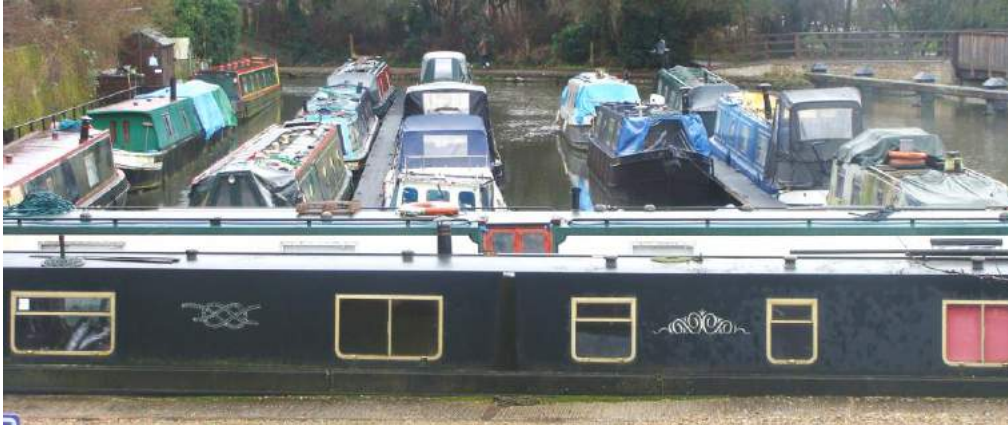
Picture 123. Hertford Basin - visually most attractive.

5.266. Wildlife sites. One such site is shown being the River Beane.