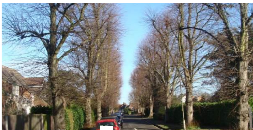
Picture 145. The high environment quality of the southern end of Queens Road is almost entirely due to the tree lined street.

5.324. Southern end of Queens Road. Accessible to the public This tree lined street adds great visual quality to this part of the street scene that would otherwise be neutral.