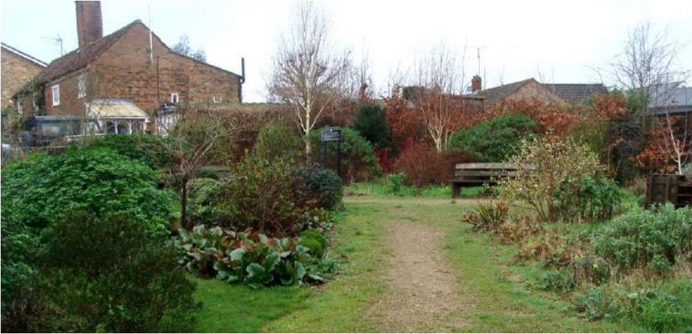
Picture 119. St Leonard's Garden - a small but important open space where additional planting to reduce the impact of modern development is worthy of consideration.

5.262. St. Leonard's churchyard. A well kept churchyard with some mature trees and many tombstones, some chest and one such chest tomb in urgent need of repair. Iron railings to front (see above).