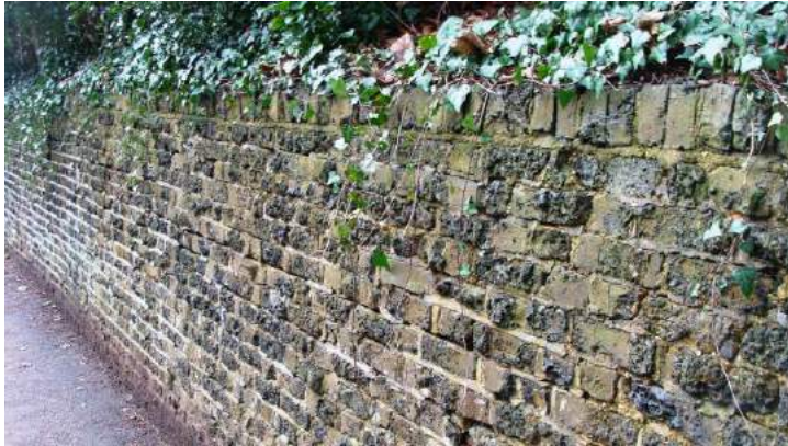
Picture 86. Interesting wall detailing on west side of Port Hill. Some bricks appear to be malformed with clinker residue attached.

5.200. Length of low wall of random construction corner of Bengo Street and Warren Park Road.