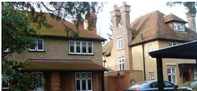
Picture 130. Quality 20th century housing on Morgans Road, note impressive chimney detail.

5.291. No. 2 Morgans Road. Probably dates from the mid 20th century. Single storey with huge steeply pitched roof chimneys. Imposing building and representative of its type and period. An Article 4 Direction to provide protection for selected features may be appropriate subject to further consideration and notification.