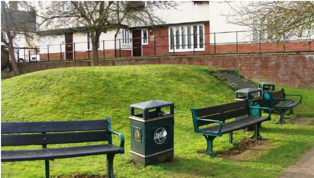
Picture 40. The Moat Garden, production of a simple landscape plan could secure real improvements to this small but important open space. The fieldworker has been advised this seating arrangement was part of an effort to restrict skateboarding on the mound but is there not a visually more satisfactory solution?

5.70. Small but important area of open space adjacent to theatre, Mill Bridge. The focal point is a good quality sculpture of Samuel Stone (17 th century Puritan minister born in the town and associated with establishing Hartford Connecticut USA) fronting a grassed area with seats, litter box and various planted areas, including high maintenance planting around statue. The grass surface is rather worn. One double litter bin broken. The area adjoins the river and visible to pedestrians viewing the adjacent water features and accessing nearby car park. It is suggested detailed landscaping proposals be prepared to enhance this important and centrally located urban space. Its current condition is a poor advertisement for visitors to the town.