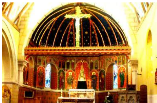
Picture 102. The new (1994) scheme of decoration of the sanctuary St Joseph's church. The original was recorded and sealed.

5.225. Scheduled Ancient Monuments There are none in Area 3.